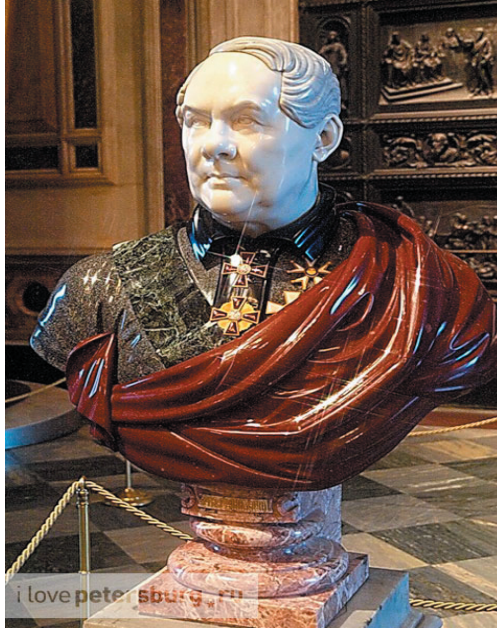
Fig. 5. A. Montferrand's bust in Isaac Cathedral in St. Petersburg ( http://ilovepetersburg... , 2017)