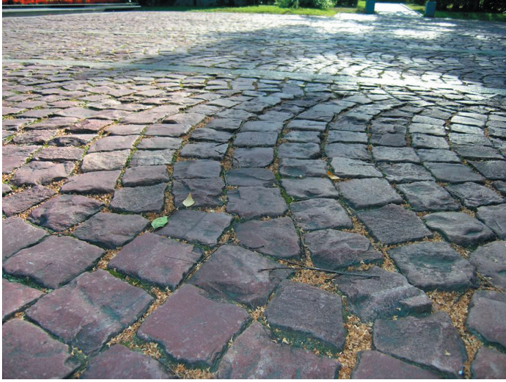
Fig. 7. Pavement made of Shoksha quartzite Ryc. 7. nawierzchnia brukowa wykonana z kwarcytu Shoksha

(Borisov, 1963). It should be mentioned that the President's backyard in the Kremlin is paved with the Shoksha quartzite slabs (fig. 7).