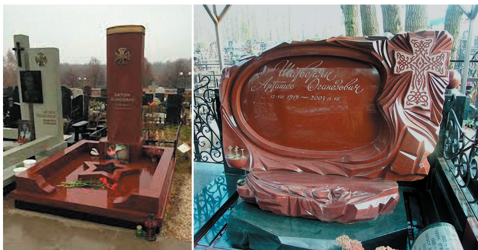
Fig. 8. Modern Shoksha quartzite products ( https://www.gd-karelia... , 2017; https://vk.com... , 2017)

Ryc. 8. Przykłady współczesnego zastosowania kwarcytu Shoksha ( https://www.gd-karelia... , 2017; https://vk.com... , 2017)