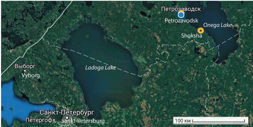
Fig. 1. Location of the Shoksha quartzite deposit (on the background of Google Map)

Рис. 1. Położenie złoża kwarcytu Shoksha (na podkładzie Google Map)