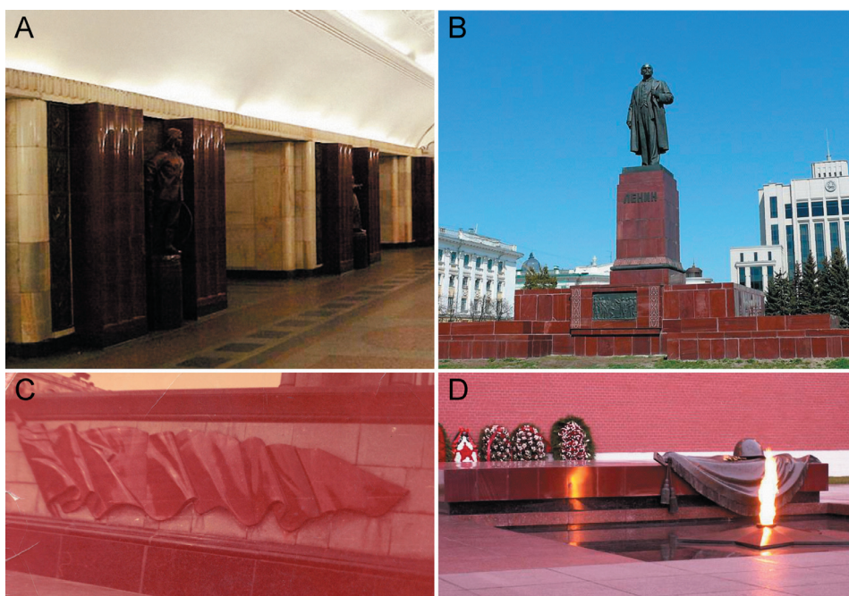
Fig. 6. Examples of application of Shoksha quartzite: A – Baumanskaya underground station in Moscow ( http://natur-kam.ru... , 2017), B – a monument to Lenin in Kazan (Photo: V. Shekov), C – a sculpture of a flag (Photo: A.V. Ryleev), D – Memorial Grave of the Unknown Soldier in Moscow ( http://natur-kam.ru... , 2017)

Ryc. 6. Przykłady zastosowania kwarcytu Shoksha: A – stacja metra Baumanskaja w Moskwie ( http://natur-kam.ru... , 2017), B – pomnik Lenina w Kazaniu (Photo: V. Shekov), C – rzeźbiona flaga (Photo: A.V. Ryleev), D – Grób Nieznanego Żołnierza w Moskwie ( http://natur-kam.ru... , 2017)