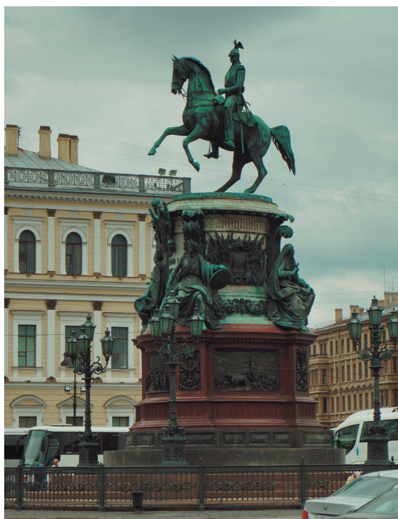
Fig. 4. Monument to Nicholas I, Isaac Square, St. Petersburg ( https://commons... , 2017)