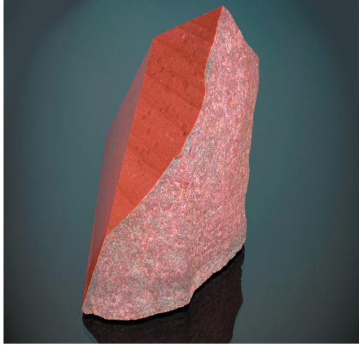
Fig. 2. Polished Shoksha crimson quartzite