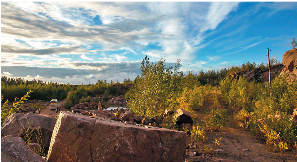
Fig. 2. Quarry on Suskunsaaari deposit Ryc. 2. Kamieniołom na złożu Suskunsaaari

The sites of cultural heritage that tumble into ruins and pass into oblivion without proper treatment are very important from historical and aesthetic viewpoints. The deposit of belogorsky marble (the present-day Kondopozhsky district of Karelia) is also noteworthy (fig. 4). This stone was very widely used in the architecture of Saint Petersburg in the late XVIII–early XIX centuries. Near Belogorskoe deposit