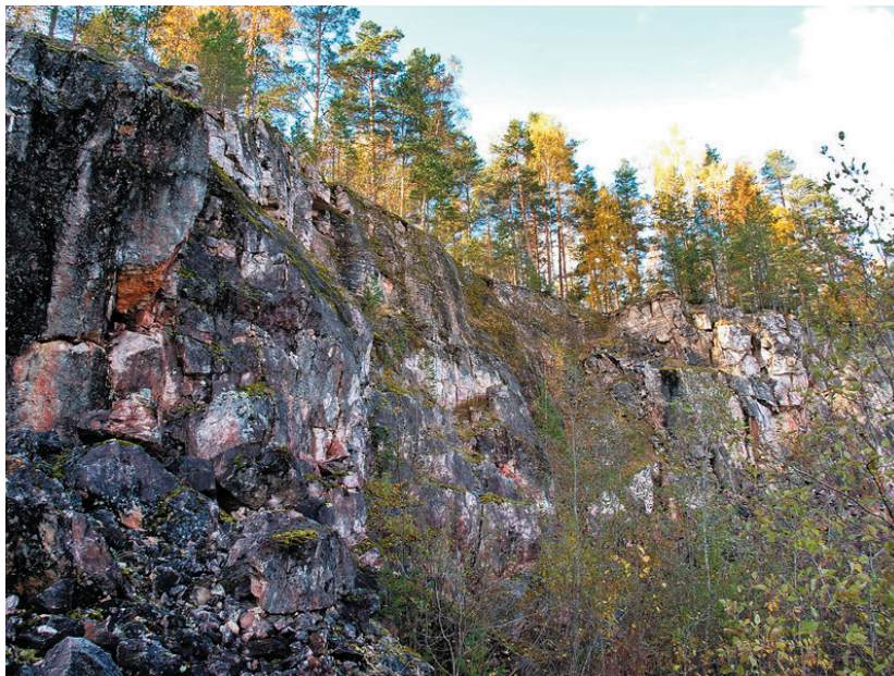
Fig. 4. Belaya Gora deposit, abandoned quarry of Tivdia marble Ryc. 4. Złoże Biała Góra, opuszczony kamieniołom marmuru Tivdia

than 200 thousand people – a quite convincing indicator for economic assessment of using such site in touristic industry.