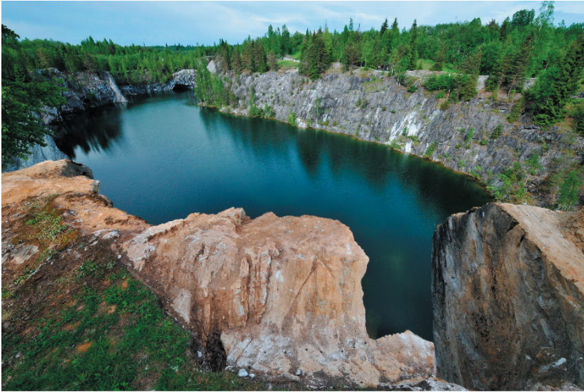
Fig. 5. The Main quarry of Ruskeala Mining Park Ryc. 5. Główny kamieniołom Górniczego Parku Ruskeala

BORISOV P.A., 1963. Stone Building Materials of Karelia (Kamennye stroitelnye materialy Karelii) . Karelian Publishing Office (Karel'skoe knizhnoe izdatelstvo). Petrozavodsk.