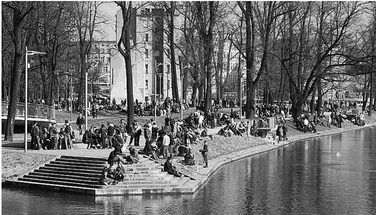
Figure 3. “Students” Slodowa Isle