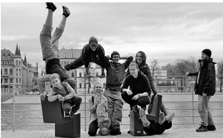
Figure 4. Official opening of the Dunikowski Boulevard

In July 2016, the author conducted an internet survey among the young inhabitants of Wrocław which were randomly selected. Out of 80 respondents, 96.3% were people between 19 and 30 years of age, 2.5% between 31 and 40 and one person aged between 41 to 50. The surveyed were asked to mark on a scale from 1 to 5 the river Odra’s importance to them. Over 57% of them marked either 4 or 5 on the