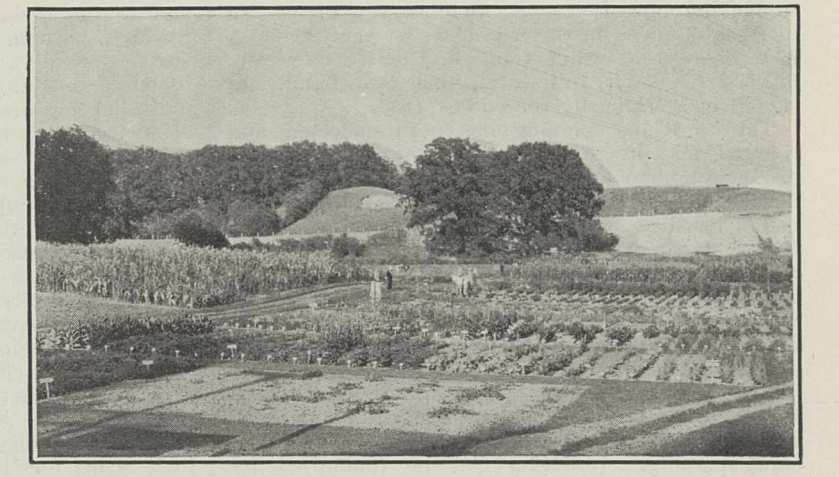
FIG. 1.—Genetic garden at the Sixth International Congress of Genetics, Ithaca

The morning sessions were devoted to general papers grouped under such topics as the nature and cause of mutations, the interrelations of cytology