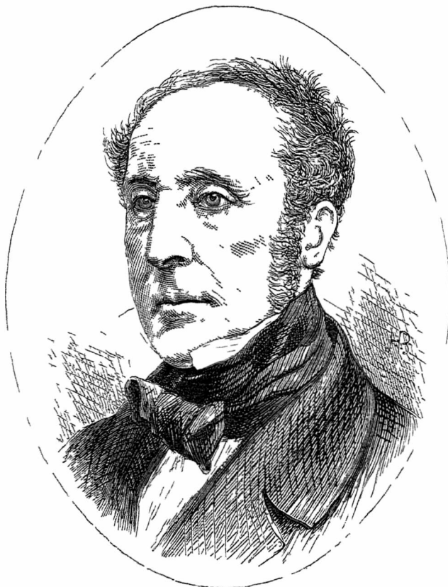
THE LATE SIR RODERICK I. MURCHISON

linked in so many ways with that of the society in which he lived, that its chronicle becomes in some degree the history of his time. And such a man was Roderick Impey Murchison. By no means standing on the highest platform of scientific intellect, a patient gatherer of facts rather than a brilliant generaliser from them, he yet gained by common consent in the commonwealth of science the position of a king, under whom men of all ranks, and even men of far higher ability and attainment than his own, were not only willing but delighted to serve. He held a place which no other man of science left among us now fills. It was not merely his achievements in geology, memorable as these were, which gave him that proud pre-eminence, nor did he owe anything to success in other branches of science, for he seldom travelled beyond what he knew to be his proper domain, nor to graces of literary style, on which men of slender acquirements often float