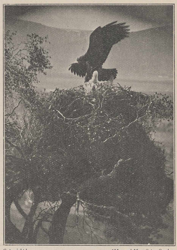
1FIG. 3.—The cock golden eagle brings in a rabbit.

When the eaglets were small there were days of wild west wind, when the squalls of hail pattered like small shot against the sides of the 'hide.' The eagle's tree rocked in the wind, and the mother eagle, as she guarded her young after having fed them, swayed gently to and fro, balancing herself with all the skill of a sailor when his ship is meeting heavy weather. The young hen eagle left the nest early in July, but the cock, being more backward (partly, no doubt, because of his ill-usage in his early days), was not ready to follow her. For some days the parents fed him in the eyrie, but then seemed to decide that he was ready to leave. Each day they brought him less food, and at last the eyrie was bare. The parents were starving him, and daily he became weaker and constantly