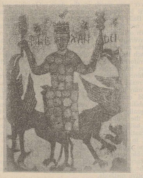
FIG. 1.—Detail of mosaic pavement, A.D. 1165, Otranto Cathedral.

San-Donino) of the subject as "Berta che filava"; and chains are shown as traces to harness the griffins. The detail of the mosaic pavement, A.D. 1165, in Otranto Cathedral bears the name Alexander, to prove there is no doubt of the subject.