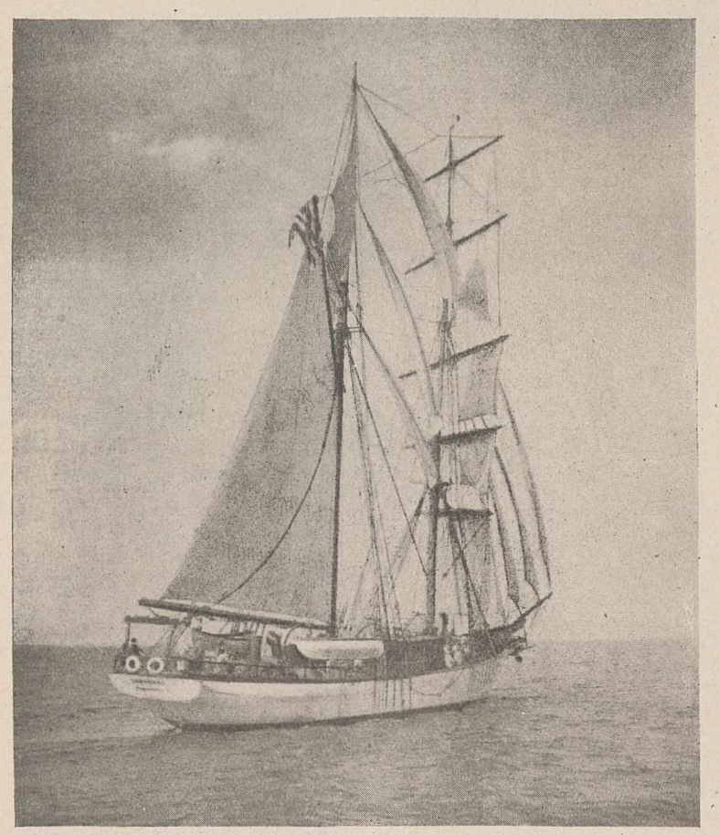
FIG. 1.-The non-magnetic ship, the Carnegie.

The experience of sea conditions has led to modifications of the instruments available in 1905 and to the development of new ones. Much work has been done with the Lloyd-Creak dip-circle, or,