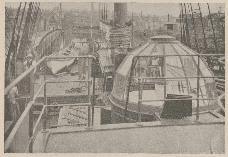
FIG. 2.-After observing-dome on the Carnegie with sea-deflector inside.

The magnetic observations made on shore are discussed in separate tables, and there are exact descriptions of the stations occupied. Consider-