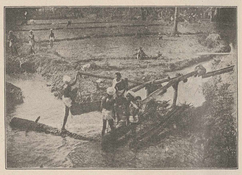
FIG. 2.-Karim (Gödävari district).

subsoil water, with the resultant deposition of salts at or near the surface; certain of these salts, sodium carbonate in particular, and the chlorides and sulphates of magnesium and sodium, are deleterious and produce alkalinity of the soil, under the influence of which crops become thin and sparse, plants acquire an air of sickliness and decline, and foliage is pale and falls