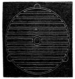
GROUND PLAN OF NEW EATTERY

The first idea of dispensing with a porous cell, and keeping the two liquids separate by gravity, is due to Mr. C. F. Varley, who proposed to put the copper-plate in the bottom of a jar; resting on it a saturated solution of sulphate of copper; resting on this a less dense solution of sulphate of zinc; and iming on this a less dense solution of sulphate of zinc; and immersed in the sulphate of zinc, the metal zinc-plate fixed near the top of the jar. But he tells me that batteries on this plan, called "gravity batteries," were carefully tried in the late Electric and International Telegraph Company's establishments, and found wanting in economy. The waste of zinc and of sulphate of copper was found to be more in them than in the ordinary porous-cell batteries. Daniell's batteries without porous cells have also been tried in France, and found unsatisfactory on account of the too free access of sulphate of copper to the zinc, which they permit. Still, Graham's and Fick's measurezinc, which they permit. Still, Graham's and Fick's measurements leave no room to doubt but that the access of sulphate of copper to the zinc would be much less rapid if by true diffusion alone, than it cannot but be in any form of porous-cell battery with vertical plates of copper and zinc opposed to one another,