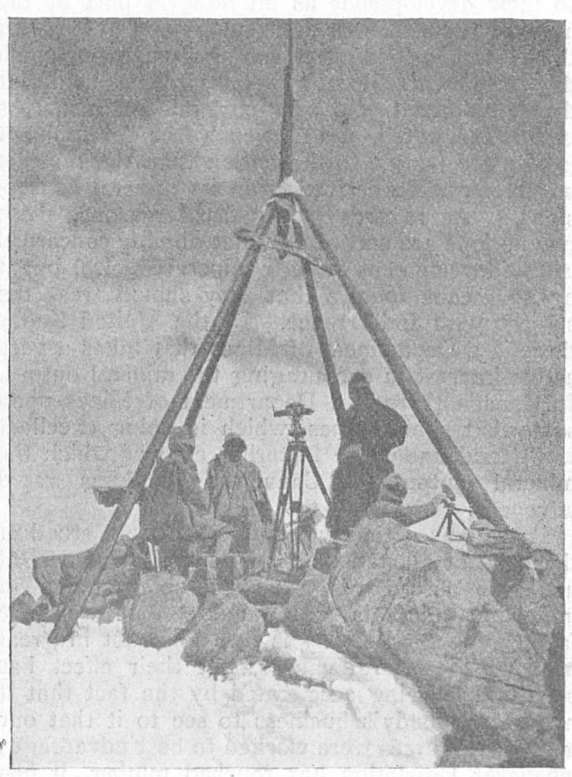
Fig. 1.—On the Russian East Station of Sarblock, 17,284 ft.

A T the meeting of the International Geodetic Association held in London in 1909 the way was cleared for the completion of a connecting link between Indian and Russian triangulations which would carry scientific measurement from Cape Comorin to Petrograd. This necessitated the extension of a geodetic series across some of the highest and most unapproachable of the snow-capped ranges in the northern Himalayan system. Between Gilgit and Salisbury Peak on the Nicolas (Russian spelling) range of the Pamirs there intervene about 100 miles of inconceivably wild and rugged mountain country distinguished