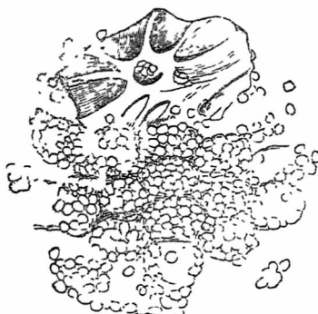
FIG. 1.—Section of Cocoa-Nib as seen under the microscope

of the commonest and worst description. If people would only trouble themselves to think that cocoa-nibs, which are simply the roasted seeds without any preparation, are retailed at 1s. 4d. per lb., how can they expect to obtain an equally genuine article in a finely-pulverised state, and packed in tinfoil and a showy outward cover, at the same price? which is what the so-called "Homœopathic" and similarly prepared cocoas are sold at. Expensive machinery in the first place, and the constant wear and tear of the same, the consumption of fuel in the steam apparatus, and the expense of packing, have all to be paid for by the con-