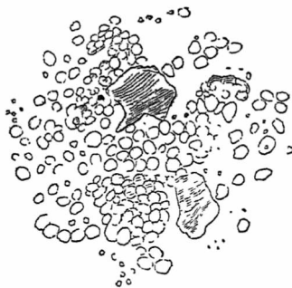
FIG. 3.—Microscopical appearance of "Cocoa Essence"

Until within the last few years, all these powdered cocoas were more or less "prepared," so that pure cocoa could not be obtained in this convenient form. An article, called "Cocoa Essence," recently introduced, has, however, dispelled this notion. We all know that the cocoa-seed naturally contains a large quantity of butter or fat (about 50 per cent.) which makes it too rich or heavy a beverage for many persons, and this more especially when we consider that other elements of nutrition, such as albumen, are also present. To deprive it entirely of its butter would be to take away one of its valuable principles; but it is possible to have too much of a good thing; therefore, by taking away about two-thirds of the butter the cocoa itself is not only improved in a dietetical point of view, but the addition of sugar, arrowroot, &c., is rendered unnecessary to take up or balance the fatty portion. Those who wish for pure cocoa in a convenient form should therefore obtain the "Cocoa Essence." It is sold in 3oz. packets at 6d. each. A small spoonful is sufficient for one cup, and, unlike the "Homœopathic," "Soluble," and other similar cocoas, it is not mixed with milk, but with a little boiling water, and stirred for a second or two until it is