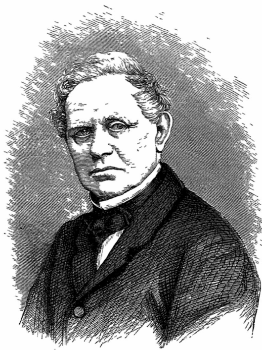
HEINRICH GUSTAV MAGNUS

The peculiar talents of Heinrich Gustav showed themselves at an early age. He exhibited a rare proficiency in mathematics when a mere child, and soon expressed a wish to devote himself to the study of nature. At the Berlin University, founded some years before, the Chair of Chemistry had passed from the hands of Klaproth into those of Mitscherlich, who was then at the height of his reputation. Young Magnus was twenty-three years old when he published his first paper on the pyrophoric nature of finely-divided metals. Two years later he received his Doctor's degree, and published a dissertation on tellurium. He subsequently passed twelve months at Stockholm, in the laboratory of Berzelius, who gave to Germany some of its greatest savants , of whom Wöhler, in Göttingen, and Gustav Rose, in Berlin, now alone survive. From Sweden he removed to Paris, returning to Berlin in 1831, and began there his university career as a lecturer on technology, a subject which he continued to teach till last summer.