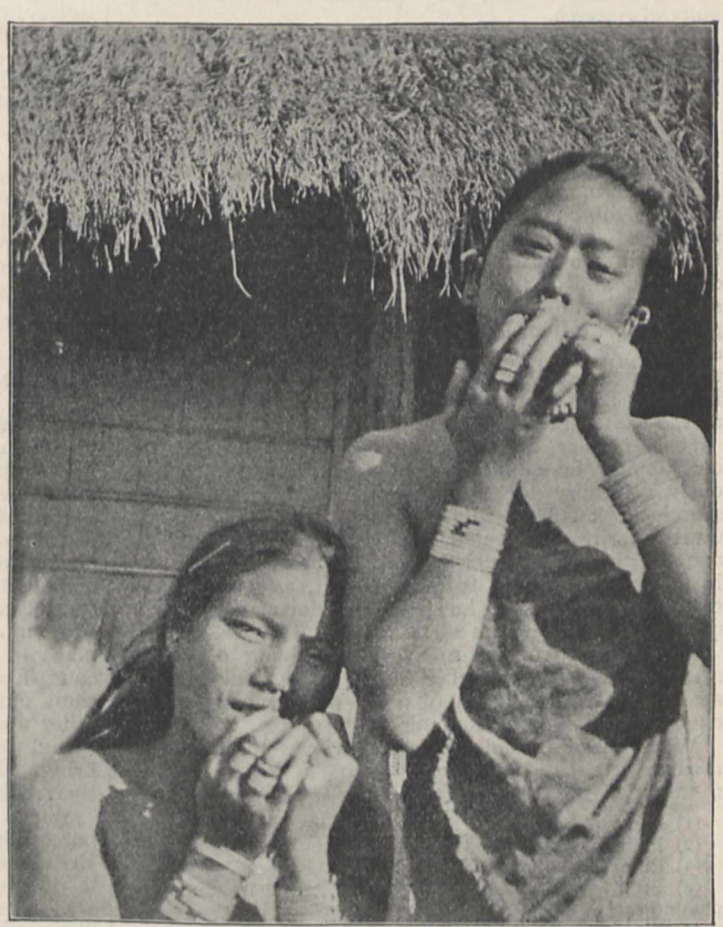
Kachári Girls playing Jew's Harps (Gongina). From "The Kacháris."

Two appendices, one describing some of the allied tribes, the other adding three additional folk tales