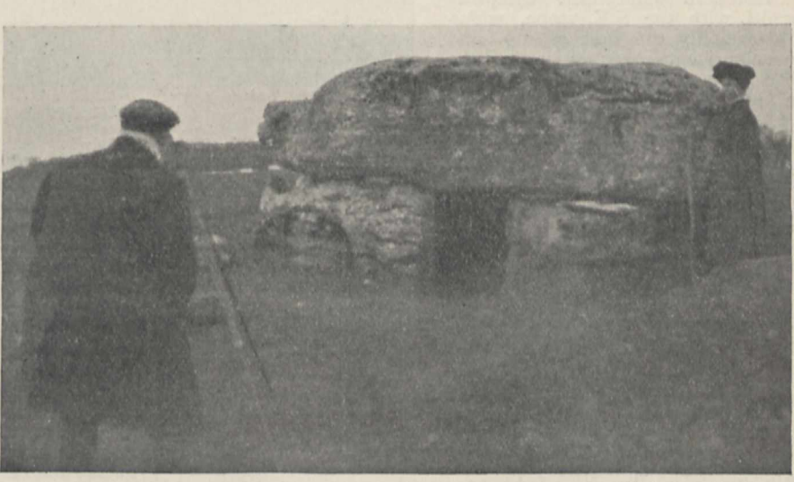
FIG. 2.- The Equinoctial (? late) Cromlech at Lligwy.

alignments were not made so frequently on the actual