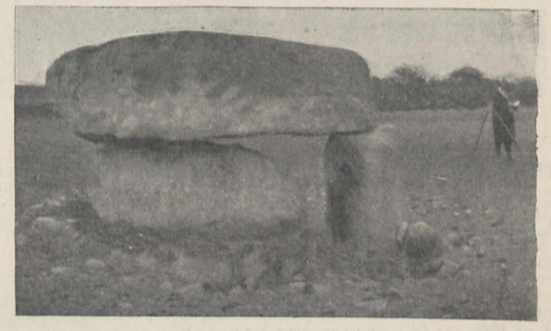
FIG. 5 .- Cefn Isaf (Winter Solstice).

"I am inclined to think . . . that we may accept as true the statement of Molyneux, that a 'slender quarry-stone, 5 or 6 feet long, shaped like a pyramid,' lay along the middle of the cave in the spot in which it is placed in his plan, and that his surmise is probably correct that it once stood upright. My view on this point is strengthened by the fact that a pyramidal