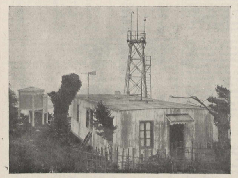
The Metecrological Observatory on the Tsukuba an.

Meteorological Observations on the Summit of the Tsukubasan, Japan.—The establishment of this first-order observatory, and the determination of the force of gravity and exact geographical position, are due to the interest taken in physical science by H.I.H. Prince Yamashina. The observatory is situated on the most westerly peak of the mountain, in lat. 36^{\circ} 13' 21'' N., long. 140^{\circ} 5' 47'' E., about forty miles north-east of Tokio, at an altitude of 2852 feet; it commands the view of the surrounding district for many miles to the north and west, while to the south and east it has an open view of the wide expanse of the Pacific Ocean. Its position is therefore extremely