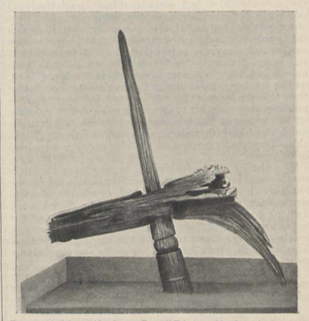
FIG. 2.—Meriah Sacrifice Post. From "Ethnograph'c Notes in Southern India," by E. Thurston.

A good illustration of the theory propounded by Mr. E. S. Hartland at the York meeting of the British Association—that both magic and religion, in their earliest forms, are based on the conception of a transmissible personality, the Mana of the Melanesian races—is found in the belief that from the eye of a man of low caste a subtle matter proceeds which contaminates food and other things upon which it falls. The most remarkable example of black magic