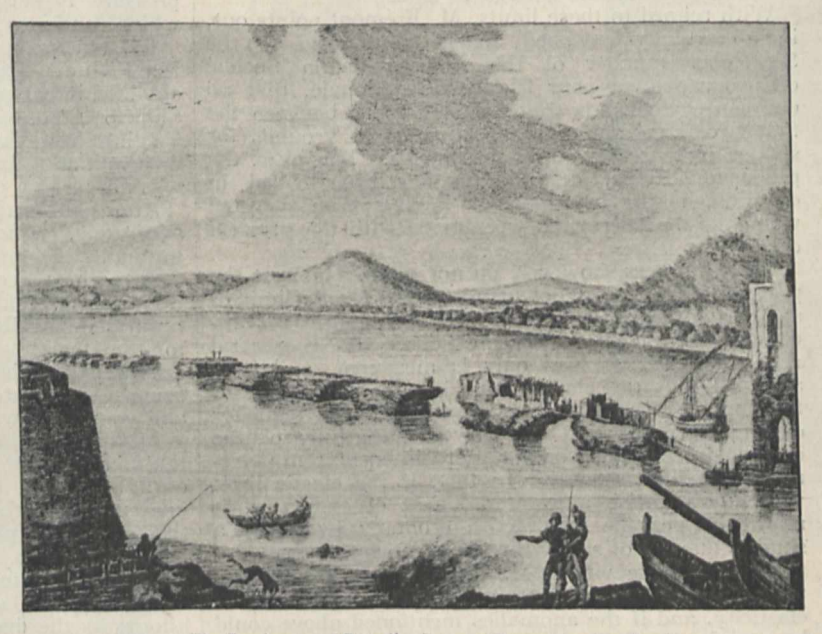
FIG. 3.-The Breakwater of Puteoli, after an eighteenth century drawing.

FIG. 2.-The Breakwater of Puteoli, after a Roman Picture.