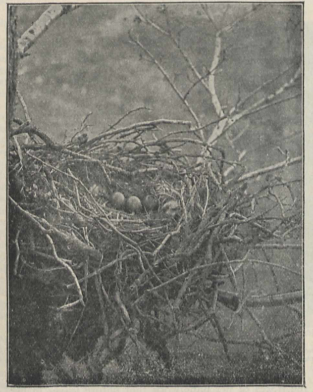
FIG. 1.—Merlin's Eggs in Crow's Old Nest.

Wild Wales is still, happily, a stronghold of the buzzard and the raven, both of which are still fairly common there (the author seems to have had the luck to see no less than three buzzards' nests with eggs in one day), and enjoy a certain amount of protection or at least toleration, while the sight of a fork-tailed kite even may still gladden the eye of the bird lover, and we read of six seen in the air together! The management of the attempt to protect the kite in Wales, in support of which some members of the British Ornithologists' Union (which should not be called the "British Ornithological Society") have subscribed liberally, was in 1903 placed in the author's hands. Accordingly, a valuable chapter gives us an account of a nesting haunt of the kite in that year. But the birds seem to have had bad luck, despite the watchful care of the author. In the nest he found the kite addled one egg and cracked the other accidentally. A visit to Tenby in the breeding season