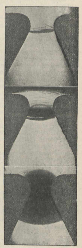
FIG. 2.—The dark areas on the test pieces correspond to the portions of the metal which have given under tensile stresses.

To sum up, M. Frémont claims with much force that there is only one elastic limit of a metal, the "real elastic limit," as determined by the method he indicates. The real limit alone has the characters of a physical constant. The other so-called limits depend on the appearance of discontinuous deformations, the presence of which is