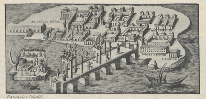
FIG. 2.-The Breakwater of Puteoli, after a Roman Picture.

ton as to the exact site of the ancient Greek colony of Palæpolis, the mothertown of Neapolis, the present Naples. This ancient town was supposed by some authorities to have stood where Naples now is, by others to have been further inland towards Aversa. Following up our hypothesis that the shore was higher by nearly 17 feet than it is now, there would be a stretch of land extending nearly half a mile out to sea at the base of the cliffs of the promontory of Posilipo; it is here, where the ruins now under water attest to the existence of numerous buildings grouped round the Gaiola rocks, that we would place Palæpolis. Close by under the lee of this extended foreshore we discovered the defensive works of an ancient harbour, and we found many traces of an ancient coast road, also submerged, which ran along the foot of the cliffs and by tunnels through some of the little headlands on the eastern side of Posilipo (Fig. 4). This road gave an easy means of communication with the neighbouring colonies, and the many proofs we have found of its existence, as well as the geographical situ-NO. 1786, VOL. 69]