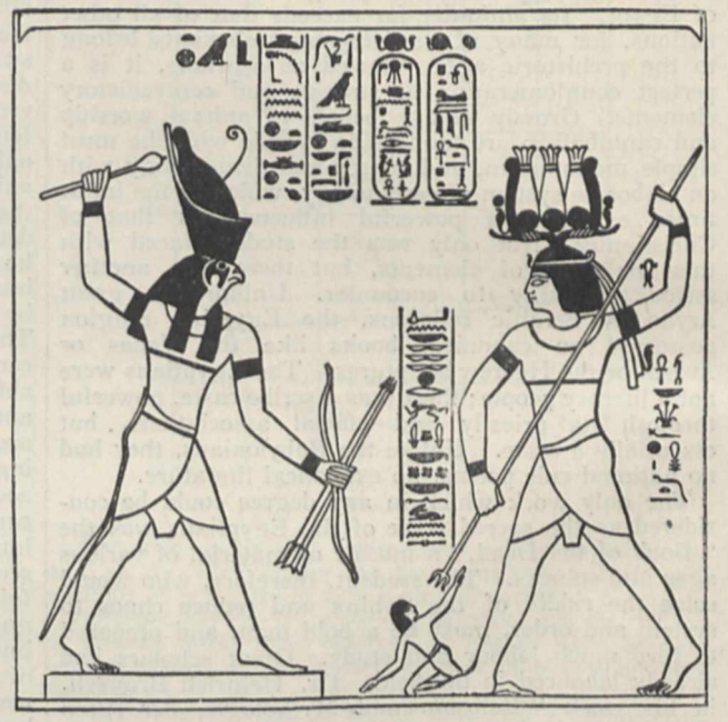
FIG. 1.-Horus of Behutet Armed (Edfu). From "Gods of the Egyptians.")

In conclusion, we must give a high word of praise to the preparation of the work; the beautiful plates and illustrations, the various tables and indices, render