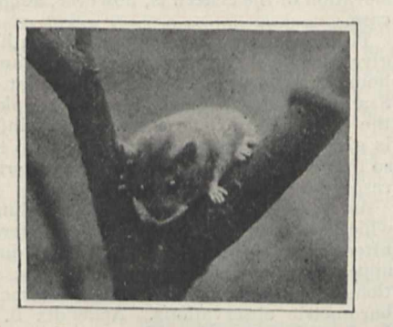
FIG. 1.-Dormouse. (From "Wee Tim'rous Beasties.")