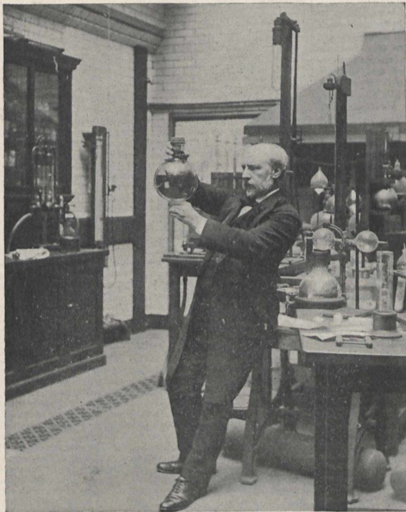
Prof. James Dewar, F.R.S.

Sir F. Abel referred to in the Hofmann memorial lecture as the movement which culminated in the foundation of the Royal College of Chemistry.