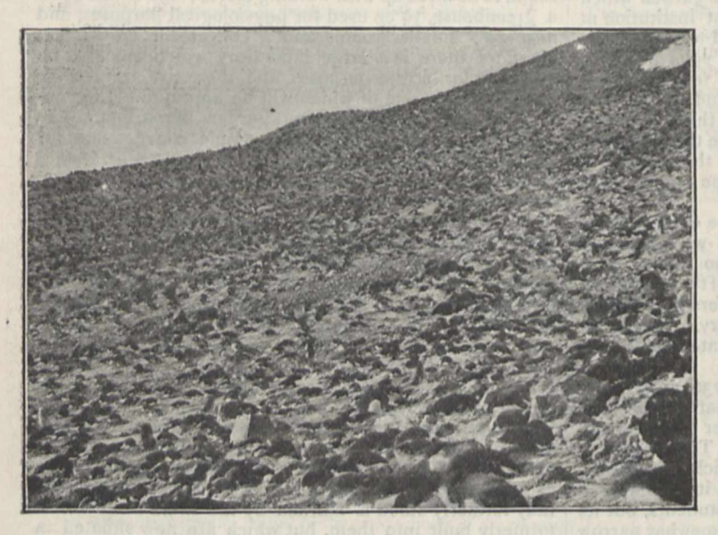
FIG. 1.-Adelia Penguins on their Nests.

BY the issue of the handsome and beautifully illustrated volume standing first on our list, the Trustees of the British Museum have followed the lead set a couple of years ago by the appearance of the "Mono-graph of Christmas Island," and have thus added a second work describing the fauna of a definite area to the long list of publications bearing their name on the titlepage. And there can be little doubt that this new departure will be welcomed by naturalists and by the public at large. In the present instance it has afforded a means of commemorating in a graceful and fitting manner the munificence and generosity of the originator of the Southern Cross expedition, and has likewise furnished zoological science with a valuable memoir on the fauna, flora and petrology of the Antarctic. How valuable such a publication is at the present time needs no comment here ; and it will accordingly suffice to say that with the "Antarctic Manual" and the present volume