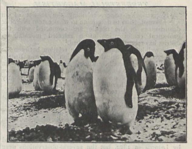
FIG. 2.-Adelia Penguins Paired.

The works standing third and fourth in our list are of a totally different type from those already noticed, and are intended for the general public rather than for scientific naturalists, although even the latter class of readers may perhaps gain some information from them in regard to those sections of zoology of which they have not made a special study. Before proceeding further we may say a word with regard to the covers and title-pages of these two little works. In the "Mammal Guide" the words "British Museum" are printed in large type and "Department of Zoology" in smaller type, whereas just the reverse of this occurs in the "Coral Guide." Apart from the question of uniformity (which we consider by no means an unimportant one), there seems no doubt that the former style is far the most preferable. It may be added that the address "Cromwell Road, London, S.W.," which appears on the cover of the "Coral Guide" is, in our opinion, quite unnecessary, and not suitable to the dignity and importance of a great public institution.