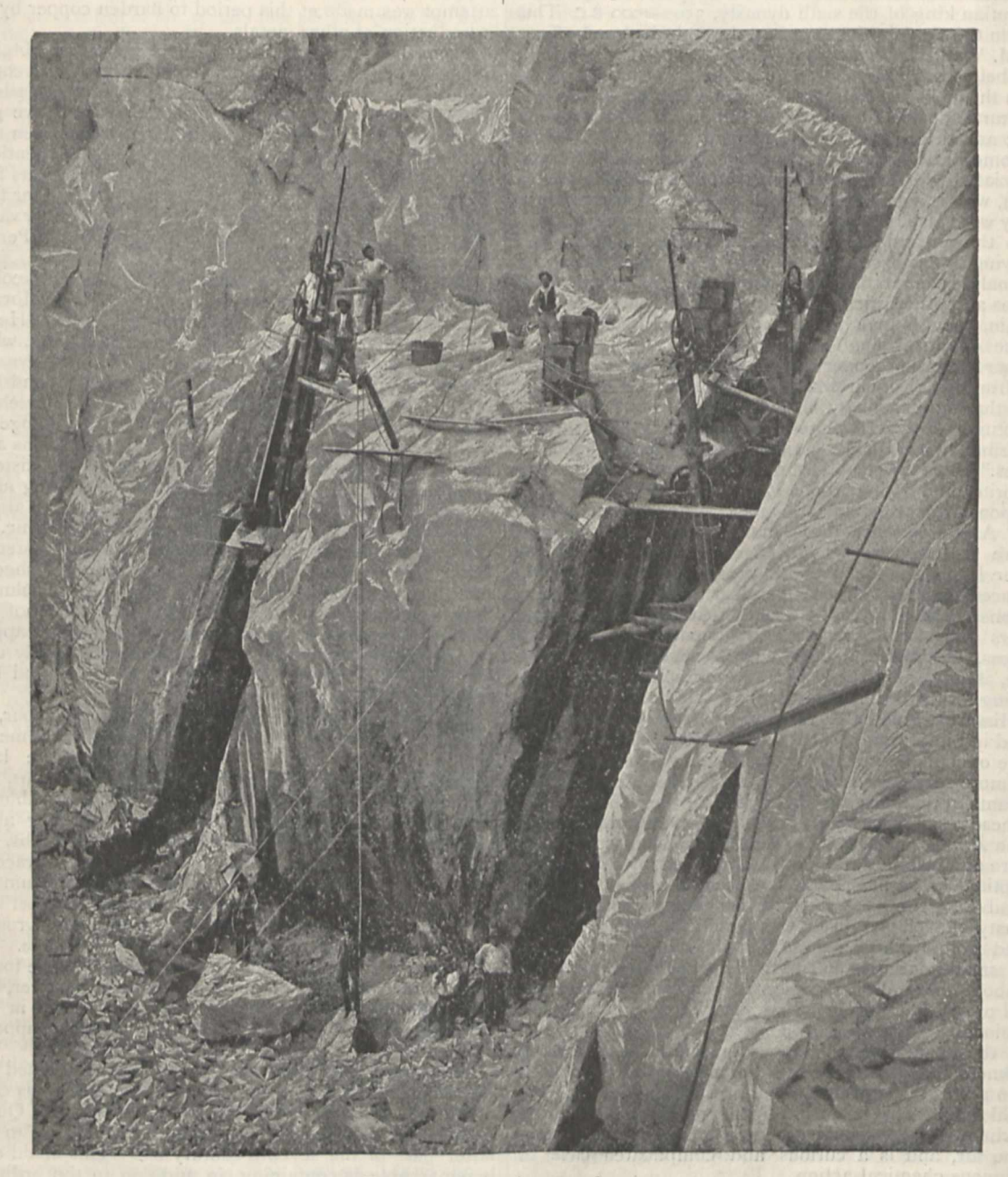
FIG. 1.-Use of the wire saw at Carrara.