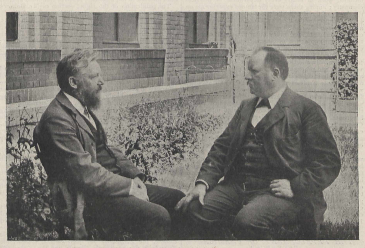
FIG. 2,-Ostwald and Arrhenius.

In 1887 came the theory of electrolytic dissociation; it explained at once the relationship which had been observed both by Arrhenius and by Ostwald between the affinity coefficients and electric conductivities; the