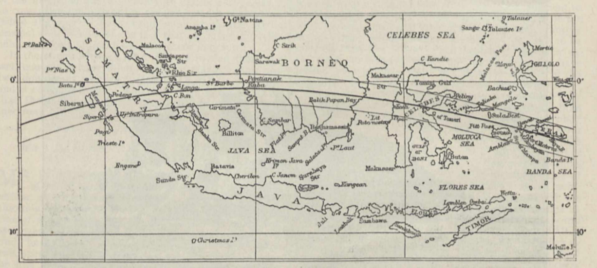
Part of the path of the moon's shadow during the total solar eclipse of May 17-18, 1901. Reproduce from the Nautical Almanac Circular, No. 18.

Ast. Assoc., vol. xi. p. 121). In the Malay Archipelago, where the maximum duration of totality on the central line is nearly 6½ minutes, the weather prospects are not quite so good. At Padang, on the west coast of Sumatra, which is one of the most accessible and otherwise most suitable stations, the percentage clearness during May is only 28, as against 50 per cent. for the Makassar Strait between Borneo and Celebes (NATURE, vol. lxiii p. 163).