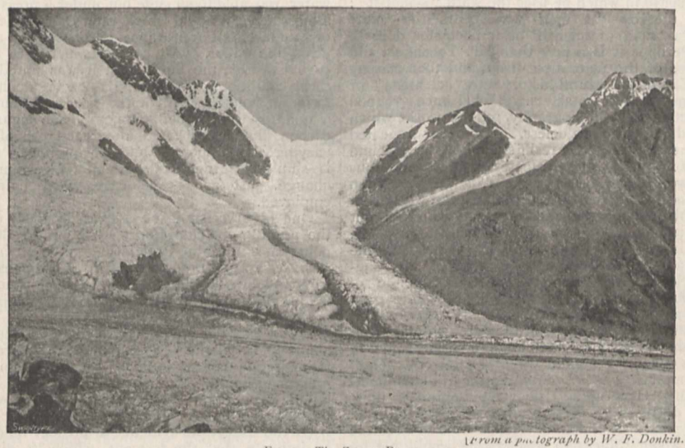
FIG. 2.- The Zanner Passes.