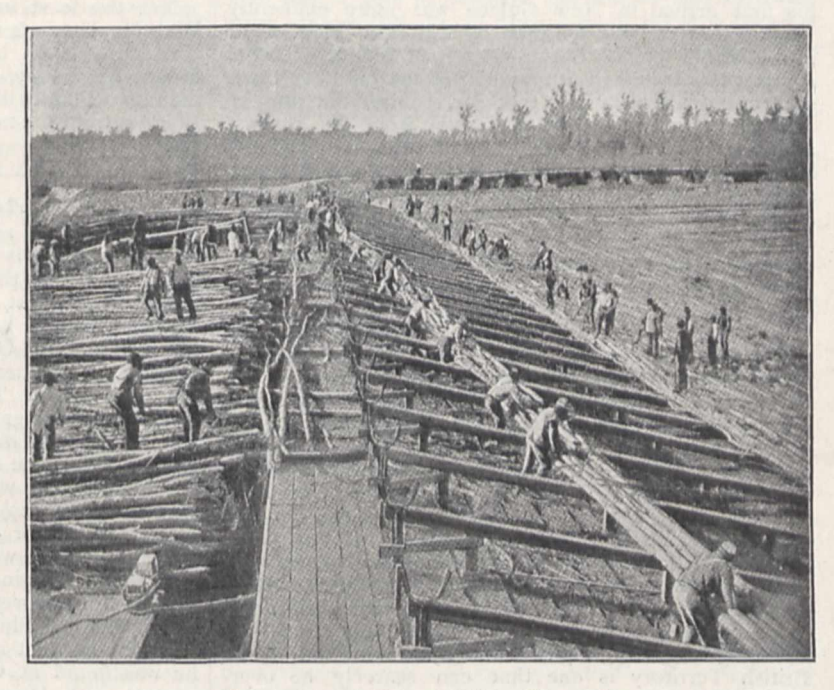
FIG. 2.-Constructing Fascine Mat on Mattress Ways

from mouth of Mambare to mouth of Vanapa. Followed Mambare to foot of Mount Scratchley where river divides to embrace the mountain. Ascended Mount Scratchley, on top of which observed with small theodolite. Found easy road west of Stanley Range, without descending re-ascended- Mount Victoria to observe, but weather unfavourable. Descended Mount Knutsford, and found a not difficult road to coast. The miners have been at work at foot of Scratchley, probably the whole of which is auriferous. Wharton Chain connects Mount Scratchley with the great Mount Albert Edward, which is also well inside British territory. All these great mountains seem composed of slate and quartz. No natives between Government Station and Mount Scratchley. On the latter is very friendly tribe. Excellent relations with natives from Mount Knutsford to the coast. Had scarcely a single completely dry day. I strongly dissuade any travelling towards the interior before April or May. Native carriers will not be permitted to proceed inland with Government sanction before then, when all possible