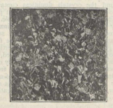
FIG. 2.—Alloy containing copper 80 per cent., zinc 20 per cent., annealed at 700°.

In the micrographical researches, in which enlargements of 30 diameters with obliquely falling light were studied,