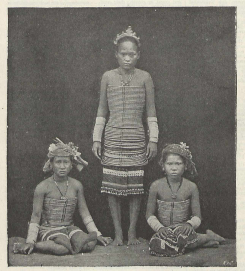
FIG. 1.—Sea-Dyak Women (Sakarang Tribe). The corsets are composed of cane hoops covered with innumerable diminutive brass links.

NTHROPOLOGISTS are again indebted to Mr. A Ling Roth for presenting to them, in a convenient form, the results of wide reading and diligent compilation. It is by such well-directed enthusiasm that the labours of the student are materially lightened ; for not only has the author, in this instance, marshalled a portentous array of accurately acknowledged quotations, but he has sedulously collected illustrations of objects preserved in numerous museums and private collections, in order to fully illustrate the descriptions that he quotes. It is perfectly evident that this has necessitated an immense amount of painstaking labour, which of itself is sufficient to raise the book from the rank of a mere compilation to