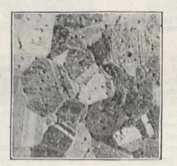
F1G. 4.—Commercial brass, containing traces of lead and tin, "burnt" by being annealed at 820°.

M. Charpy prepares the alloys for examination with the microscope by etching the polished surface by electrolytic attack He points out that the fracture is useless as a guide to the mechanical properties of any metal or alloy. It has usually been supposed, owing to the appearance of the fracture, that a highly crystalline metal is necessarily fragile; but this is far from being the case. Brass may be mainly composed of crystals as much as one millimetre in diameter without any interstitial matter, and yet may have an elongation of 60