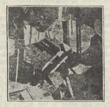
FIG. 3.—The same annealed at 900°, showing increase in the size of the crystals.

appearances were noted by M. Charpy corresponding to many of the results of the mechanical tests. Thus, for example, on hardening alloys containing from o to 35 per cent. of zinc by passing them through the rolls, the crystals are gradually deformed and disappear, a homogeneous granulated surface being obtained. When the hardened alloys are annealed, the crystals are reformed, their size depending on the maximum temperature attained, and not on the length of time during which they were subjected to it. No striking change is produced by reheating to temperatures below that at which