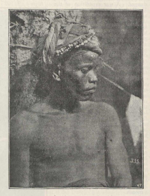
Fig. 4.-Battak gentleman.

At Engano, Modigliani was able to obtain three skulls, and took six excellent plaster casts from the living. His series of photographs is also fine; but unfortunately some of the best were spoiled by the heat. I have already noted the remarkable resemblance which the natives of Engano show with those of the Nicobar Islands. There are amongst them faces which also recall Polynesian and especially Micronesian types. Thus the photographs taken by my friend, over a hundred,