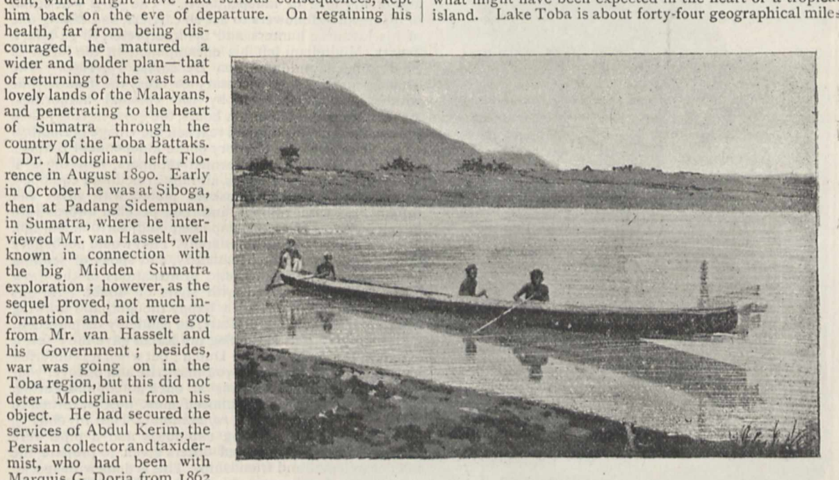
Fig. 1.-Solu (boat) on Lake Toba.

By the middle of October 1890, Modigliani was at Balige on the shore of Lake Toba, and on the edge of the wild and unexplored Battak country, the land of his dreams. He describes the lake as grand and imposing, but more like a northern lake, such as Loch Lomond, because of its bleak bare mountains and early mists, than what might have been expected in the heart of a tropical island. Lake Toba is about forty-four geographical miles