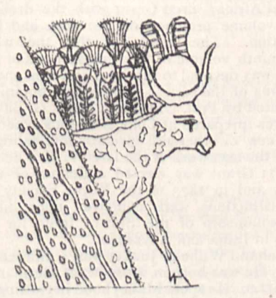
FIG. 4.-The cow Hathor appearing from the western hills of Thebes.

(3) Hathor was the cow of the western hills of Thebes. It is in these hills that the temple Dêr el-Bahari lies, and this temple if oriented originally to Sirius would have been founded about 3000 B.C., when Sirius would have an amplitude of 26°.