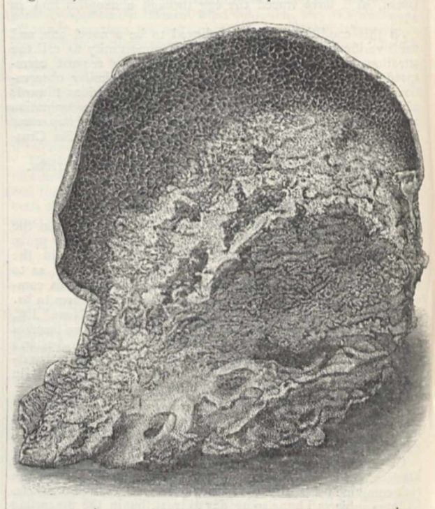
FIG. 18.—Mature fructification of Merulius lacrymans . The cake-like mass of felted mycelium has developed a series of areolae (in the upper part of the figure), on the walls of which the spores are produced. In the natural position this spore-bearing layer is turned downwards, and in a moist environment pellucid drops or "tears" distil from it. The barren part in the foreground was on a wall, and the remainder on the lower side of a beam: the fungus was photographed in this position to show the structure.

To understand the structure of this fructification we may contrast it with that of the Polyporus or Trametes referred to in the last article; where in the latter we find a number of pores leading each into a tubular cavity lined with the cells which produce the spores, the Merulius shows a number of shallow depressions lined by the sporogenous cells. The ridges which separate these depressed areolæ have a more or less zigzag course, running together, and sometimes the whole presents a likeness to