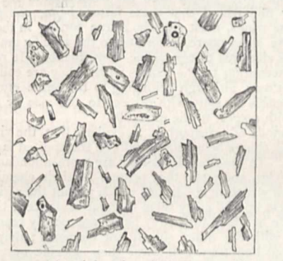
FIG. 1.—Vitreous particles of the ashes of Krakatoa, which fell at Batavia, August 27, 1883 (sto).

shows markedly the peculiarity due to the bullous structure. If this gray-green pulverulent matter be placed under the microscope, it is seen to be composed of almost impalpable grains, with a mean diameter of O'I mm., which are almost exclusively colourless or brownish vitreous particles permeated by bubbles. The bubbles are rarely globular, but often elongated, as we have just pointed out, and they give a drawn-out appearance to the fragments. As often happens, several bubbles are elongated parallel to each other, and in this case the pore becomes a simple streak ; the fragment then assumes a fibrous texture, which may cause it to resemble at first sight a striated felspar or an organic remnant; but an examination of the outline will never allow of this confusion. If we examine the terminal contours and lines of these bubble-containing fragments, we never find that they are straight lines, but that they show a ragged appearance, all the sinuosities being curvilinear. This mode of fracture is in correspondence with the vacuolated structure, and, just as in the porous pumice, the vitreous volcanic ashes are permeated by vacuoles ; besides, everything goes to show that the fragmentary condition and the fresh fractures are due to a tension phenomenon which affects these vitreous matters in a manner analogous o what is observed in the "Rupert's drops."