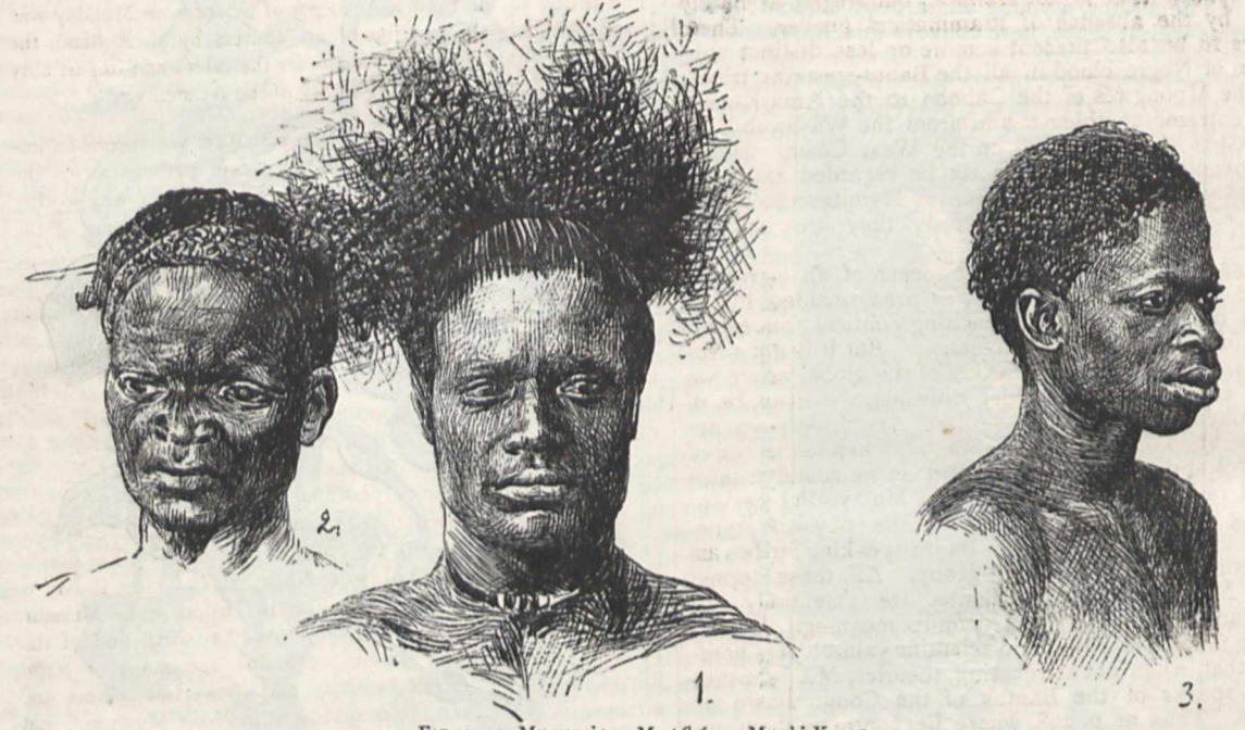
FIG. 3.-1, Mu-yansi; 2, Mu-téké; 3, Mu-shi-Kongo.

His botanical descriptions and sketches are generally admirable, as, for instance, of the Lissochilus giganteus (see Fig 2), "a splendid orchid that shoots up often to the height of six feet from the ground, bearing such a head of red-mauve, golden-centred blossoms as scarcely any flower in the world can equal for beauty and delicacy of form. These orchids, with their light-green, spear-like