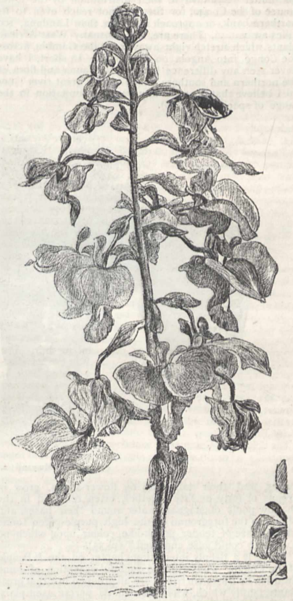
FIG. 2.-Lissochilus giganteus.

artery from terrace to terrace to the grassy steppes and park-like uplands of the interior. Informed by the quickening influences of the new philosophy now accepted by all intelligent students of nature, he compares as he describes, carefully observes, and in apparently trifling incidents endlessly recurring throughout long ages he discovers the causes of mighty revolutions in the organic world. In Stanley Pool and elsewhere on the Congo he meets with numerous floating islands, tangled masses of aquatic vegetation, firmly matted together by their roots and fibres, and strong enough to bear the