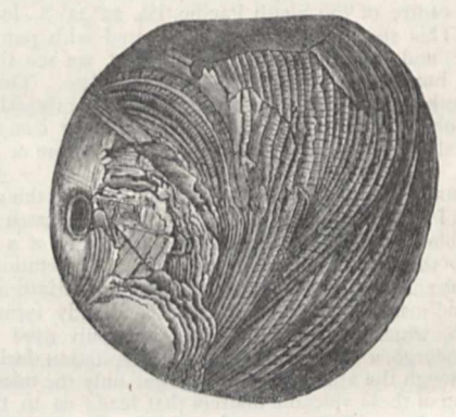
Fig. 4.—Spherule of bronzite (25: 1) from 3500 fathoms in the Central South Pacific, showing many of the peculiarities belonging to chondres of bronzite or enstatite.

We have limited our remarks at this time to these succinct details, but we believe that we have said enough to show that these spherules in their essential characters are related to the chondres of meteorites, and have the same mode of formation. In conclusion, we may state that when the coating of manganese depositions, which surround sharks' teeth, ear-bones of Cetaceans and other nuclei, is broken off and pounded in a mortar to