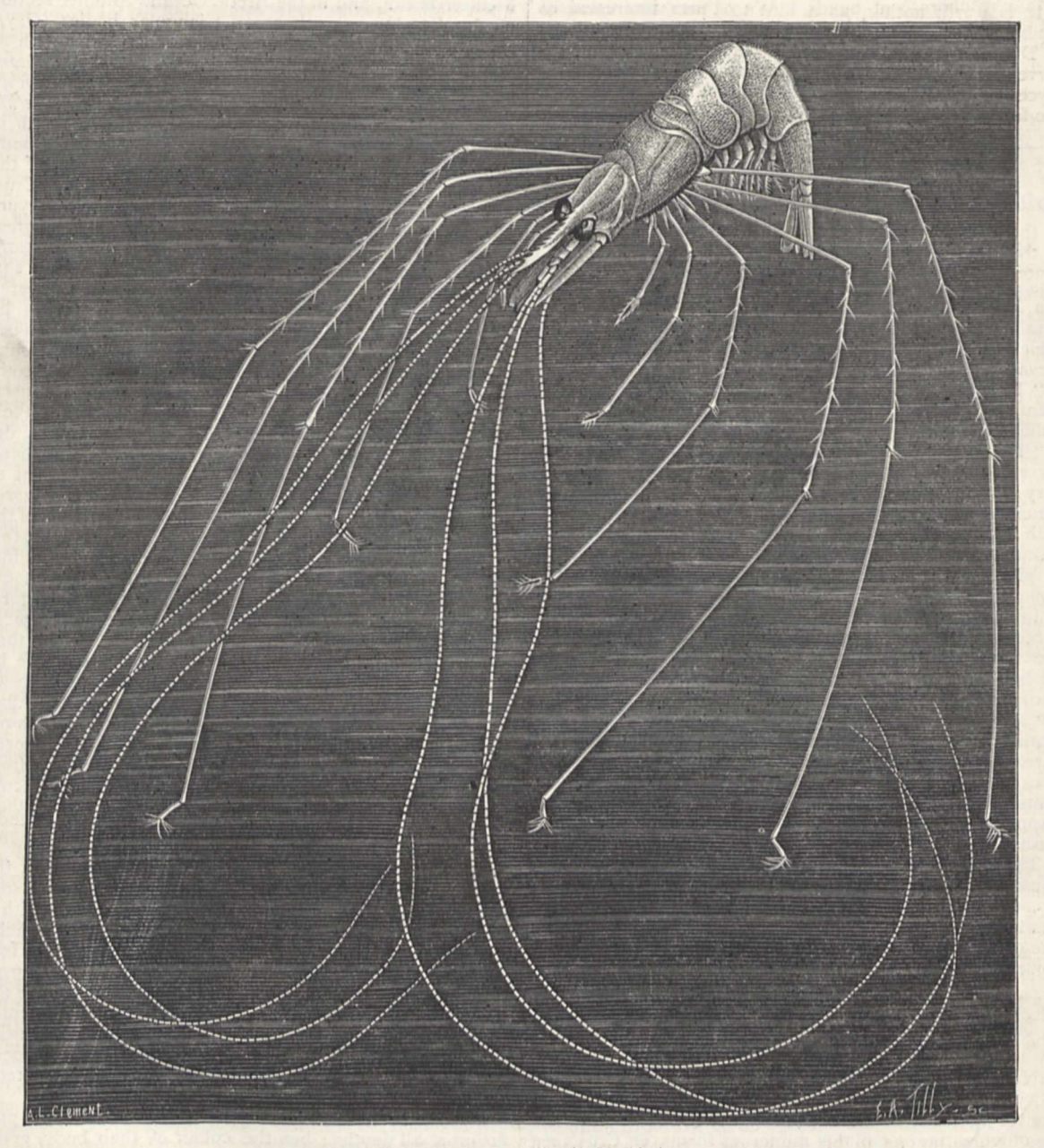
Nematocarcinus gracilipes (A. M. Edw.).

were taken at very great depths. Off the Cape Verd Islands, from a depth of 500 metres, a thousand individuals of a new species of Pandalus were taken. Among the most remarkable of all of these forms is the one which, through the courtesy of the editor of LaNature, from which journal this notice is in part trans-lated, we are enabled to give the accompanying illustration. Named Nematocarcinus gracilipes by Alphonse