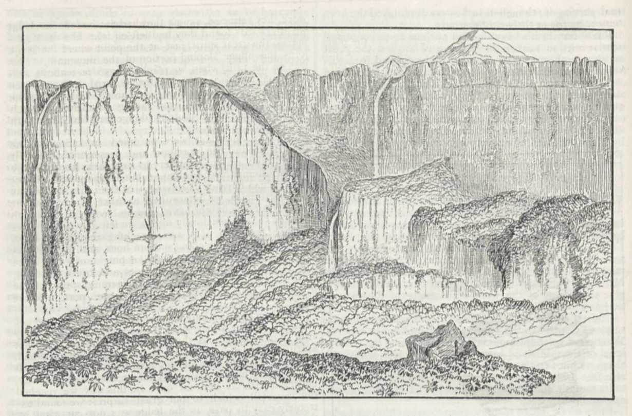
FIG. 1.-Part of south-west face of Roraima, showing ledge by which we ascended.