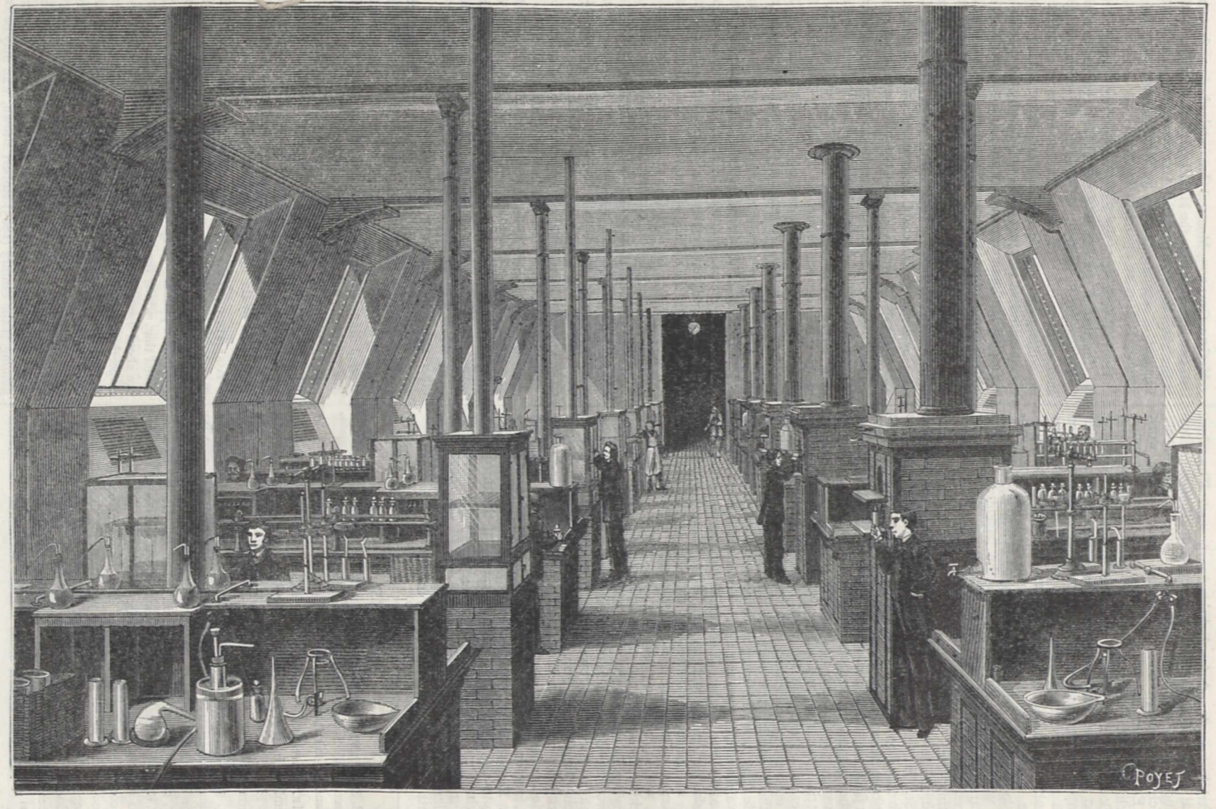
Fig. 2 .- The New Central School: General View of the Great Laboratory or Third Year Students.