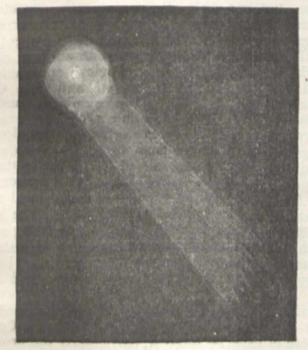
Schaeberle's Comet, August 28, 8h. 32m.

The appearance of this comet throughout has been peculiarly distinguished from that class in which jets of light streaming