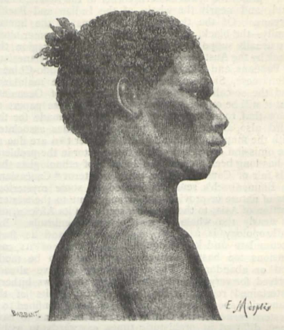
FIG. 4.-Full-blood Papûan Type. North-west Coast New Guinea.