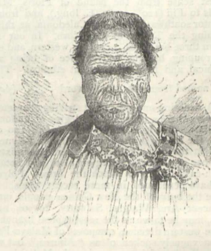
FIG. 10 .- Maori Type.

(plate 51). The Negrito and Hottentot hair is usually described as growing in separate woolly tufts, or, as Topinard puts it, "in little peppercorn masses, separated by bald spaces." In his "Genealogical Classification, of the Human