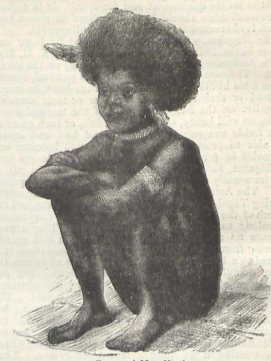
FIG. 9.- A Motu Youth.