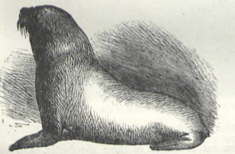
FIG. 3 .- Waiting to be fed.

In his description of the fur and hair seals, Dr. Murie, as was to be expected, is quite at home, and we have, among other accounts of these wonderful creatures, a long one of that sea lion which lived so long in the London Gardens. This animal seemed to pass its time between sleeping and eating, and we give two out of a series of illustrations which depict its habits—one of it when fast asleep (Fig. 2), the other when it is in "a watchful attitude," waiting to be fed (Fig. 3); it was well known to all visitors to the gardens. It was in the habit of devouring upwards of twenty-five pounds' weight of fish every day, and not thinking this too much. It was originally captured in