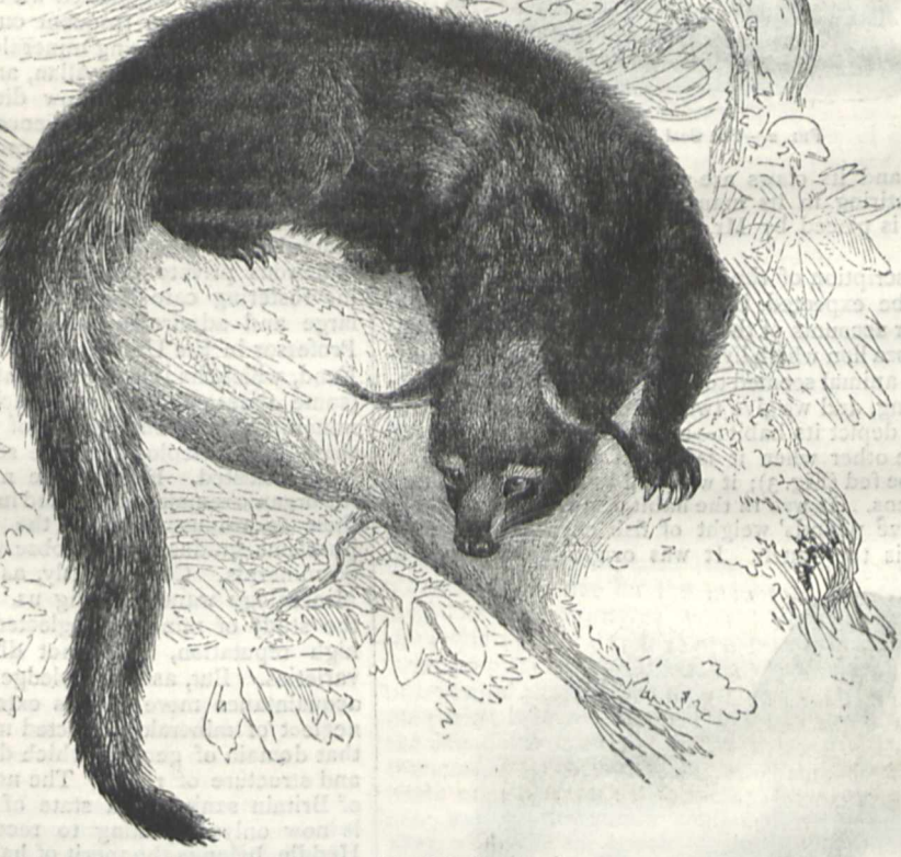
FIG. 1.-The Binturong (Arctictis linturong).