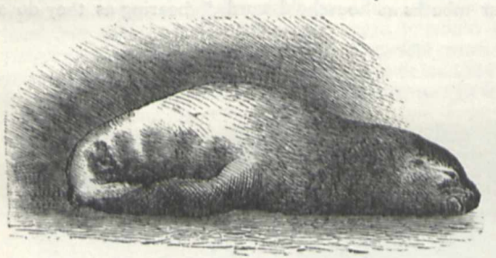
FIG. 2.-The Seal asleep.

"The Binturong (Arctictis binturong) is a curious little animal of a black colour, with a white border to its ears; it has a large head and a turned-up nose; its tail is immensely long, thick, and tapering, and which is very remarkable, it is prehensile, like that of a new world monkey. It is from twenty-eight to thirty inches in length from the snout to the root of its tail, and the tail itself is nearly the same length. It is quite nocturnal, solitary, and arboreal in its habits. In creeping along the larger branches, it is aided by its prehensile tail. It is omnivorous, eating small animals, birds, insects, and fruits. Its howl is loud. It walks entirely on the soles