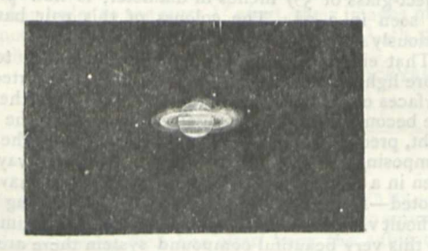
FIG. 5 -Saturn and his moons (general view with a 33 inch object-glass.)

WHETHER the telescope be of the first or last order of excellence, its light-grasping powers will be practically the same; there is therefore a great distinction to be drawn between the illuminating and defining power.