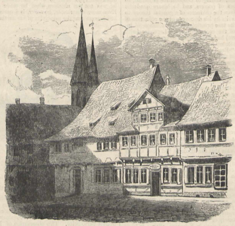
Gauss' Birthplace in Brunswick.

The discovery of the planet Ceres at Palermo on the first day of the present century led to Gauss's taking up the subject of astronomy. He did not come into possession of the requisite data until the October following. In a few weeks he determined the elements of its orbit with sufficient accuracy so that the Baron de Zach was enabled to rediscover the planet at the first attempt he made for that purpose on December 7. This discovery was soon followed by that of three other small planets. These discoveries supplied Gauss with the means of planets. These discoveries supplied Gauss with the inclusion of further improving his solution of the problem, and in 1809 he brought out at Hamburg his "Theoria motus corporum calestium in sectionibus conicis solem ambientium." This contains an "elaborate discussion of the various problems which present themselves in the determination of the movements of planets and comets from observations made on them under any circumstances." 1 Gauss's other astronomical researches are chiefly contained in De Zach's Monatliche Correspondenz, the Transactions of the Royal Society of Göttingen, and the Astronomische Nachrichten; all are contributions of the highest order of excellence.