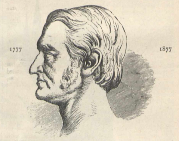
Carl Friedrich Gauss.

many other functions beside the circular functions, and in particular to the transcendents dependent on the integral \sqrt{1-x^4}