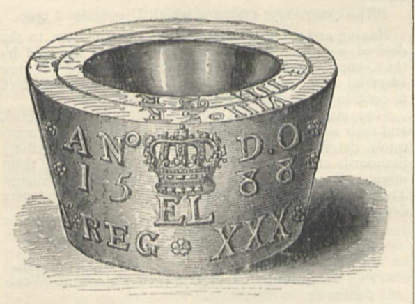
FIG 5 .- Queen Elizabeth's Standard Troy Pound of eight and four ounces

For constructing this standard, the first point to be