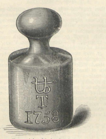
FIG. 4 .- Form and size of the lost Standard Troy Pound.

'HE standard unit of imperial weight is the avoirdupois pound of platinum, constructed under the superintendence of the Commission for Restoration of the Standards. The mode of constructing this new standard