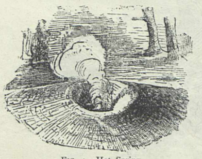
FIG. 4.-Hot Spring.

There are two classes of springs in the Yellowstone valley, one in which lime predominates, in the other silica. With the exception of the White Mountain Spring in Gardiner's River, and one or two of not much importance, the other springs of the Yellowstone and Firehole basins are siliceous. They may be divided again into intermittent, boiling and spouting, and quiet springs. Those of the first class are always above boiling point during the period of action, but during the interval the temperature lowers to 150°. Those of the second are always at the boiling point, and some of them throw the water up two to six feet by regular pulsations. The springs of the third class may have once been geysers, but are now quiet, and have a wide range of temperature, from 188° to 80°. Where the temperature is reduced below 150° great quantities of the sesquioxide of iron are deposited by the water, lining the inside of the funnel, and covering the surface where the water flows. Taken in the aggregate, these springs have been in constant operation during our present period, and