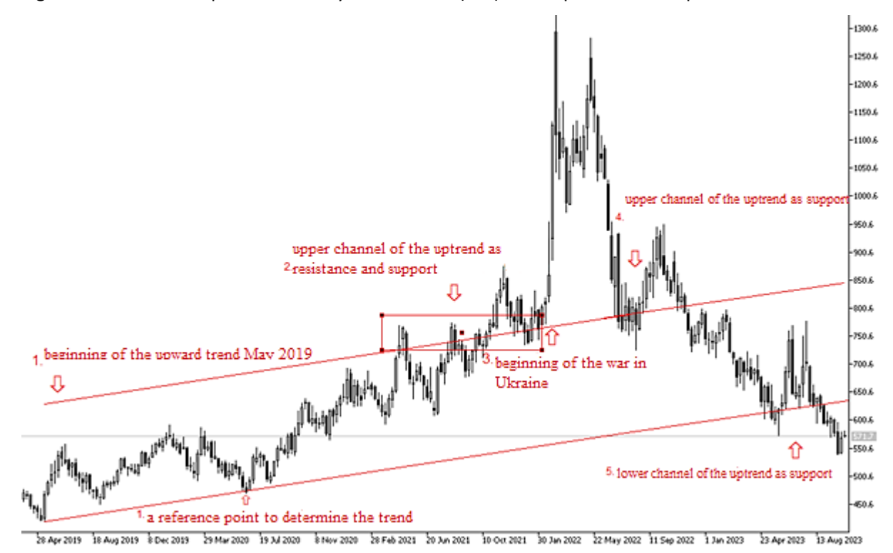
Figure 2 shows wheat prices in weekly candlesticks (W1) from April 2019 to September 2023.

(X-axis - time, Y-axis - price in US dollar cents per 1 bushel of wheat<sup>7</sup>)