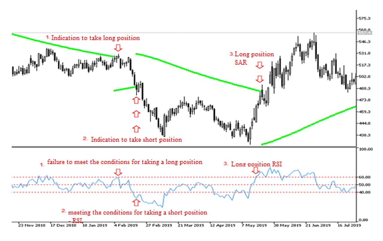
Fig. 3. Chart D1 of wheat price quotations with indicators indicated

resistance (the price only briefly rose above the indicated level and then fell below it) and then as support before further growth. Point 3 marks the beginning of the war in Ukraine and the massive price spike that followed. From the point of view of a technical analyst, it is clear that this rally was in line with the trend that had been in place for many weeks – while the magnitude of the rally was a surprise. Points 4 and 5 are the levels on the trend line that acted as support during the price correction that occurred as time went on and investor attitudes changed. In both cases (numbers 4 and 5), one can see how the price 'bounced' off the level set, first by the upper and then by the lower channel of the trend line. It can be predicted that in future the price of wheat will try to 'meet' the lower channel of the trend determined in the drawing, while according to the art of technical analysis it is also necessary to determine the channel of the downward trend, starting from the price highs of spring 2022.