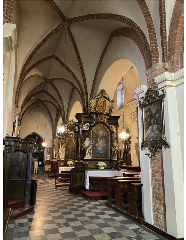
Fig. 4. Opole, the post-Dominican church of Our Lady of Sorrows and St. Wojciech, north aisle – view towards the east

Il. 3. Opole, kościół poddominikański pw. Matki Boskiej Bolesnej i św. Wojciecha, nawa główna w widoku ku wschodowi