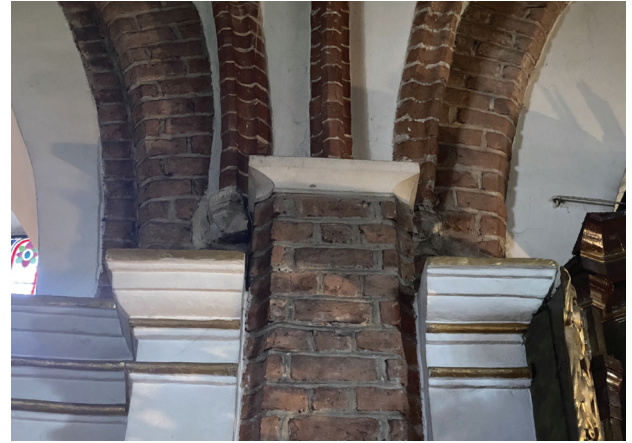
Fig. 8. Opole, post-Dominican church of Our Lady of Sorrows and St. Wojciech, northern aisle, detail of the upper part of the pillar and the tas-de-charge of the inter-nave arcades

The texture and colours of the Gothic façade were made of bricks measuring 7.7–9 × 10.8–12.0 × 24.5–25.7 cm, which were arranged in a regular two-colour stretcher