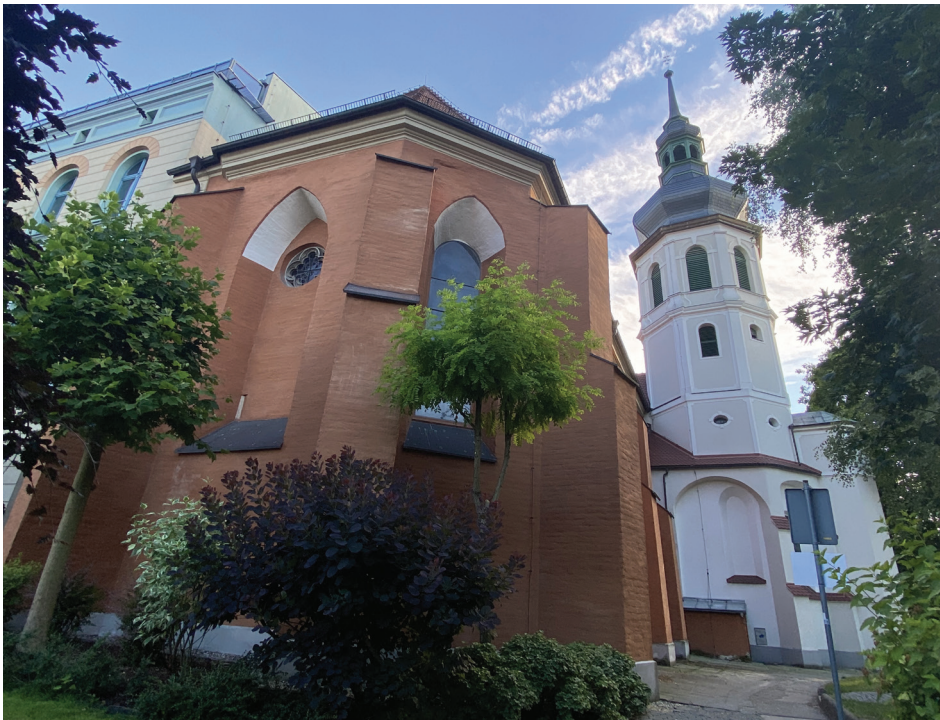
Fig. 2. Opole, the post-Dominican church of Our Lady of Sorrows and St. Wojciech, view from the east (photo by A. Legendziewicz)

Il. 2. Opole, kościół poddominikański pw. Matki Boskiej Bolesnej i św. Wojciecha, widok od wschodu (fot. A. Legendziewicz)