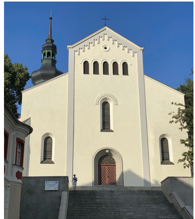
Fig. 1. Opole, post-Dominican church of Our Lady of Sorrows and St. Wojciech, view from the west

The four-span nave has a varied spatial layout – basilica-like on the south side, and pseudo-basilica on the north. Its façades are devoid of buttresses – except for one diagonal buttress in the north-western corner. The side aisles and the main nave from the west are illuminated by windows with semi-circular arches. The windows in the southern