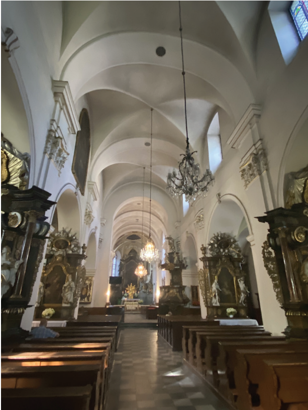
Fig. 3. Opole, the post-Dominican church of Our Lady of Sorrows and St. Wojciech, the central nave – view towards the east

Il. 3. Opole, kościół poddominikański pw. Matki Boskiej Bolesnej i św. Wojciecha, nawa główna w widoku ku wschodowi