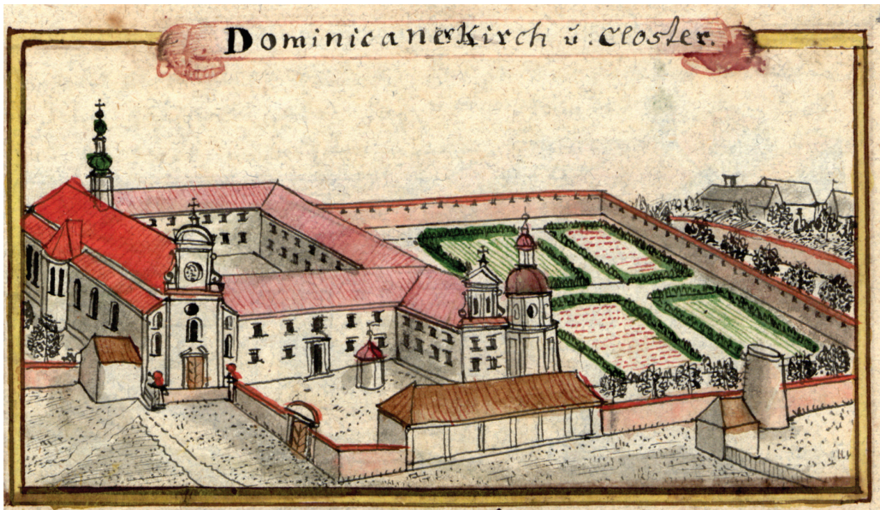
Fig. 5. Opole, post-Dominican church of Our Lady of Sorrows and St. Wojciech, view from the north-west, engraving from around the mid-18 th century. F.B. Werner

Il. 5. Opole, kościół poddominikański pw. Matki Boskiej Bolesnej i św. Wojciecha, widok od północnego zachodu, rycina z około połowy XVIII w. F.B. Wenera