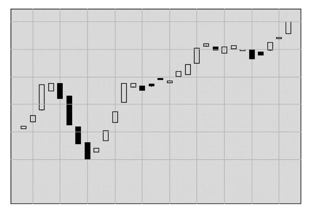
Figure 2. Visualization of a neuron representing 30 subsequent candles – the opening and closing values

The input signal for such a network is the representation of current technical situation for selected stock. Representation must be the same as for the neuron from specific network, so it must take into consideration the recent N candles and candle parameters (opening, closing, minimum price, maximum price, etc.). Values inside