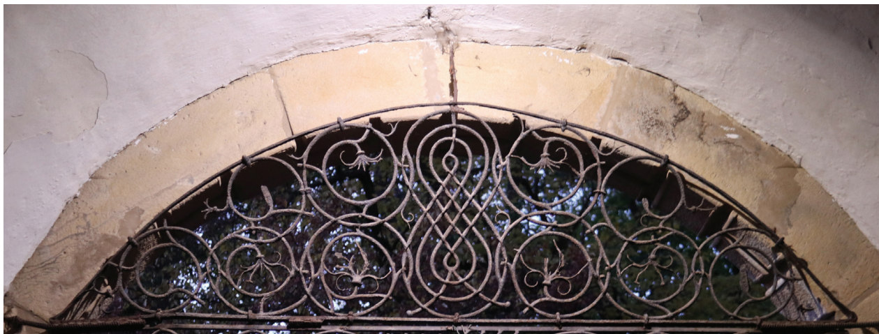
Fig. 10. Grille in the gate of the lower gatehouse. View from the inside

Il. 10. Krata w bramie dolnego budynku bramnego. Widok od strony wnętrza