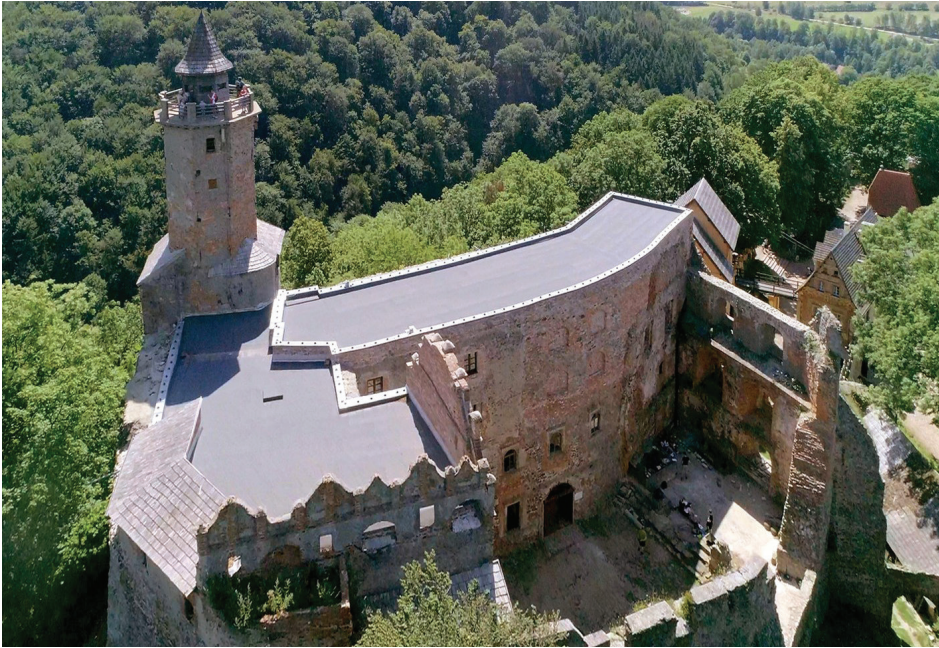
Fig. 6. Grodno Castle from the northern side. View from a drone

Il. 6. Zamek Grodno od strony północnej. Widok z drona