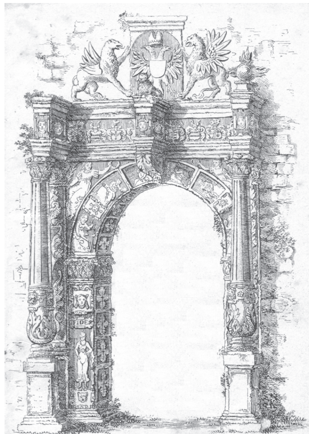
Fig. 1. Foregate portal on the cover of August Zemplin's book (drawing from around 1823, source: [2], in the collection of the University Library in Wrocław)

Il. 1. Portal przedbramia na okładce książki Augusta Zemplina (rys. ok. 1823 r., źródło: [2], w zbiorach Biblioteki Uniwersyteckiej we Wrocławiu)