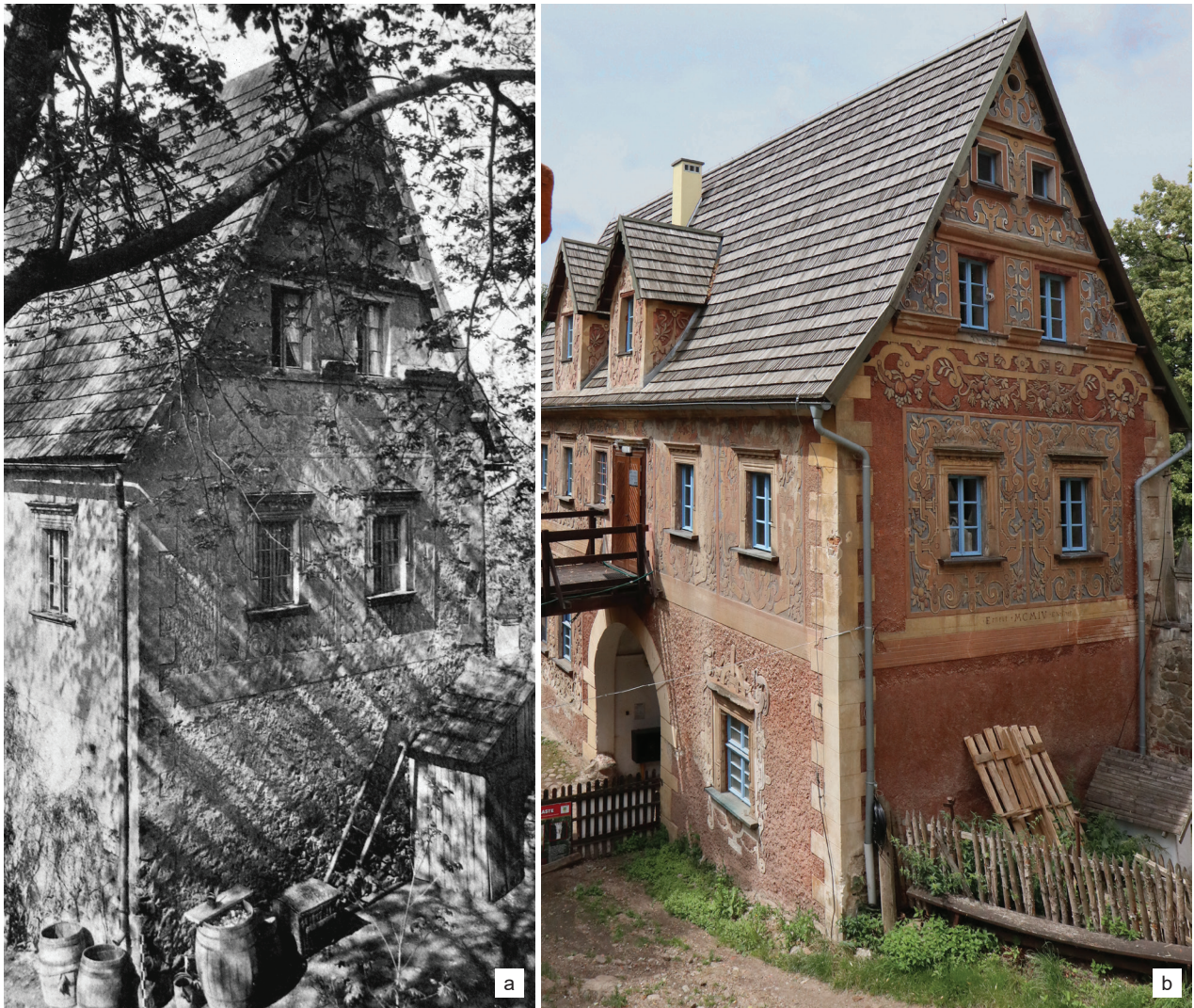
Fig. 9. Zagórze Śląskie, Grodno Castle. The gatehouse of the lower castle: a) view from the north-east with the original sgraffito decoration, photo from around 1903 (after: [25, Taf. 90.2]), b) view from the north-east with the sgraffito decoration reconstructed in 1904 (photo by A. Gryglewska, 2019)

Il. 9. Zagórze Śląskie, zamek Grodno. Widok budynku bramnego dolnego zamku: a) widok od północnego wschodu z oryginalną dekoracją sgraffitową, fot. ok. 1903 r. (za: [25, Taf. 90.2]), b) widok od północnego wschodu ze zrekonstruowaną w 1904 r. dekoracją sgraffitową (fot. A. Gryglewska, 2019)