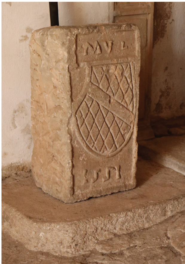
Fig. 3. A block of stone of Matthäus von Logau with the coat of arms and the date displayed in the entrance hall of the upper castle

Il. 3. Cios kamienny Matthäusa von Logau z herbem i datą eksponowany w sieni górnego zamku