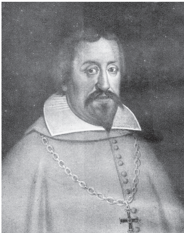
Fig. 2. Portrait of Bishop Kaspar von Logau in the years 1562–1574 (source: [16, p. I], in the collection of the University Library in Wrocław)