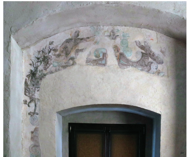
Fig. 5. Window recess with relics of polychrome from the 2 nd half of the 16 th century in the room on the second floor of the eastern wing of the castle

Il. 5. Wnęka okienna z relikwiami polichromii z 2. połowy XVI w. w izbie na II piętrze wschodniego skrzydła zamku