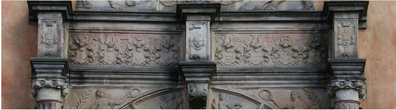
Fig. 4. Fragment of the foregate portal. Entablature with a frieze strip with heraldic decoration

Il. 4. Fragment portalu przedbramia. Belkowanie z pasem fryzy z dekoracją heraldyczną