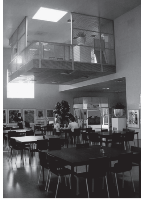
Fig. 2 Interior of the added multi-functional room in Saarphatistraat Offices.

Indeed, the free composition of the functional and spatial design of the building resembles the structure of a sponge due to the layout of the rooms and the wall perforation system visible both in the plans and sections of the building. That impression is intensified by its copper cladding which is also perforated both on external walls and the reveals perpendicular to them, which makes the openings look like they penetrate into the building. The elements of the perforated cladding were also used in the interior design, covering lighting and ventilation installations. The self-similarity between window openings of various sizes and the mechanical ventilation as well as the three-dimensional design of details evoke associations with the Menger Sponge – one of the most important clas-