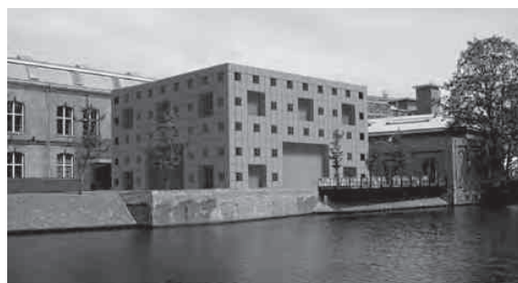
Fig. 5. Fragment of the Menger Sponge as an alternative version of the addition to Sarphatistraat Offices.

It is, however, difficult to determine if the strict application of the mathematical model of the Menger Sponge