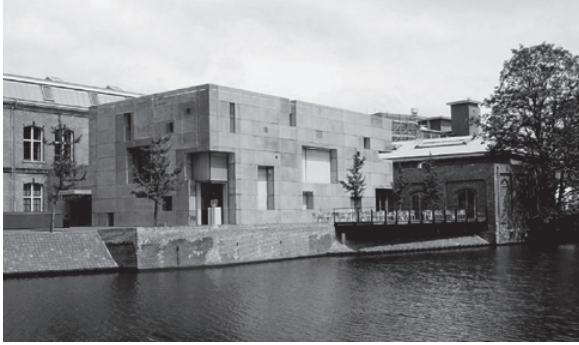
Fig. 1. Saarphatistraat Offices, view from the Singel Gracht canal. Arch. Steven Holl.

Il. 1. Saarphatistraat Office, widok od strony kanału Singel Gracht. Arch. Steven Holl.