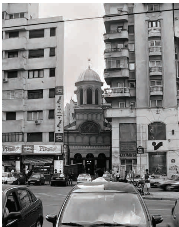
Fig. 14. Historic Orthodox Church hidden among socialist architecture around Piata Unirii

Ceașescu's activities resulted in irreversible changes in the face of Bucharest. The diverse historic landscape of the city was replaced with a monotonous and oversized urban design. The only remains of the destroyed district are its historic orthodox churches and monasteries which for ideological reasons were blocked by new buildings or hidden inside the quarters (Fig. 14).