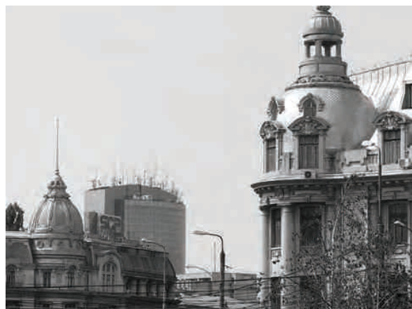
Fig. 6. Eclectic architecture of Piața Universității

Over the last two decades of the 19 th century, a number of representative buildings of public utility and government administration were erected in the area of the