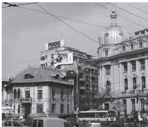
Fig. 1. Neo-Romanian style, modernism and eclecticism in architecture of Piața Romăna

a myriad of directions which formed under the influence of Western European ideas. On the other hand, the picturesque disorder of Bucharest and the magnificence