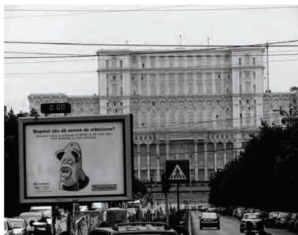
Fig. 12. The Palace of the Parliament (former People’s House) at the closing of the viewing axis

The schematic and monumental architecture of these buildings is a combination of socialist realism, a sort of Ricardo Bofill’s European post-modernism and the style of official building in North Korea, with which the dictator maintained close relations (Fig. 13).