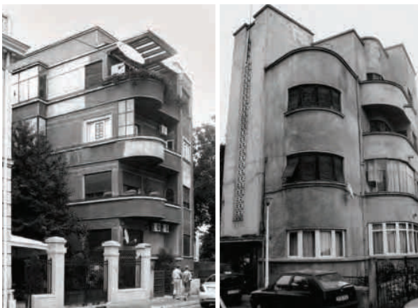
Fig. 10. Examples of modern houses in Bucharest

Il. 9. Współistnienie modernizmu i eklektyzmu