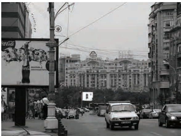
Fig. 13. View of former "Socialist City"

Il. 13. Widok dawnego „Miasta Socjalistycznego”