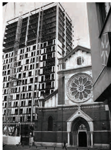
Fig. 15. Controversial investments by the Catholic Cathedral and Armenian Church

Il. 15. Kontrowersyjne inwestycje przy Katedrze Katolickiej i Kościele Ormiańskim