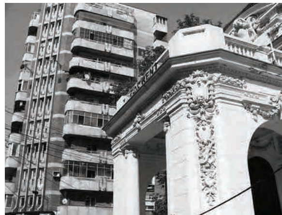
Fig. 7. City house with rich decorations from the period of the “Little Paris”

Il. 6. Eklektyczna zabudowa Piața Universității