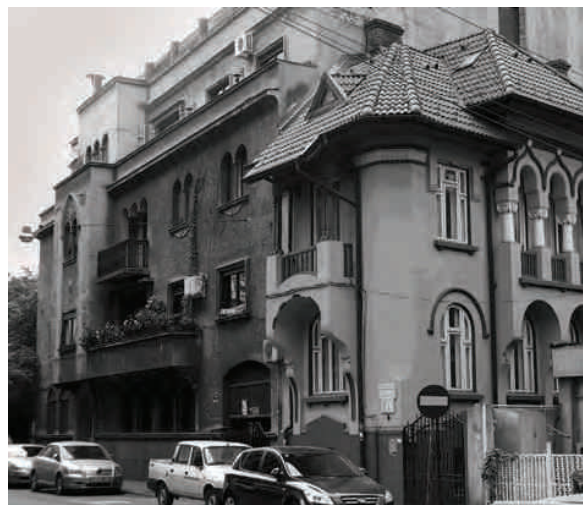
Fig. 5. In the foreground, Neo-Romanian city house; in the background, modern building with details inspired by indigenous style

The indigenous style has numerous variations which vary depending on the moment of origin and the architect's ingenuity. Apart from academic examples of the Neo-Romanian school, the indigenous elements were introduced selectively into eclectic architecture and even modern designs from the 1930s (Fig. 5).