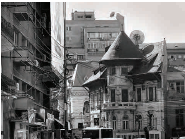
Fig. 2. Diversified architecture of Bucharest center

II. 2. Zróznicowana zabudowa śródmieścia Bukaresztu