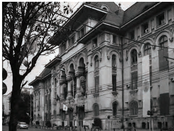
Fig. 4. Town Hall in Bucharest (1906–1910) designed in the Neo-Romanian style by Petre Antonescu (photo: W. Januszewski)

II. 3. Cerkiew Kretzulescu (1720–1722) na placu Rewolucji (fot. W. Januszewski)