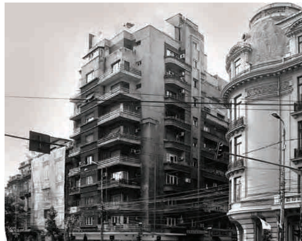
Fig. 9. Coexistence of modernism and eclecticism

Il. 8. Modernistyczna zabudowa Bulevardul Magheru – budynek towarzystwa ubezpieczeniowego z 1929 r. – arch. Horia Creanga