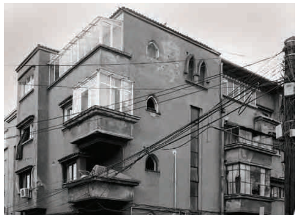
Fig. 11. Modern body of the building and historicizing detail

Il. 10. Przykłady modernistycznych domów w Bukareszcie