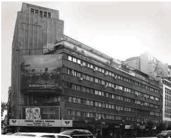
Fig. 8. Modern architecture of Bulevardul Magheru – ARO insurance building from 1929 – designed by Horia Creanga

cultural life at that time. Its advocates gathered around Contimporanul – a magazine published between 1924 and 1934. It was a forum for the young generation of designers who adopted the ideas of architecture of the Bauhaus, Le Corbusier or de Stijl. Hundreds of new buildings in the