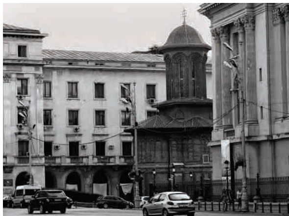
Fig. 3. Kretzulescu Orthodox Church (1720–1722) in the Revolution Square

At the beginning of the 20 th century, after a period of uncritical fascination with the Western European patterns, these buildings inspired the architects who wished to express the national ideas (Fig. 4). One of the most prominent repre-