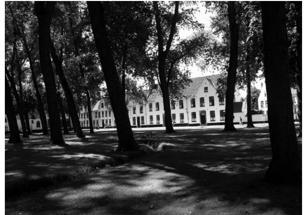
Fig. 6. Begijnhof in Brugia, Belgium

Il. 6. Begijnhof w Brugi, Belgia