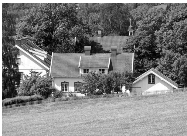
Fig. 5. Nest residential development in Lillehammer, Norway

The form of traditional Norwegian group settlements, which are built in the eastern part of the country, is designed on the basis of one or two internal courtyards. In the past, these complexes were inhabited by family communities. The 18 th -century farm Bjørnstad, which is now situated in the open-air ethnographical Maihaugen museum in Lillehammer, is a classical example. The farm has a two-courtyard arrangement. Around the first one there are three houses: two seasonal ones (winter and summer) and the so called chimneyless cabin with a cen-