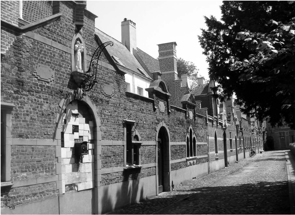
Fig. 7. Begijnhof in Antwerp, Belgium