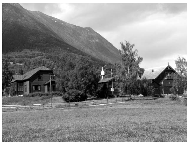
Fig. 4. Farm development with a nest arrangement in Lom, Norway

II. 5. Zabudowa mieszkaniowa gniazdowa w Lillehammer, Norwegia