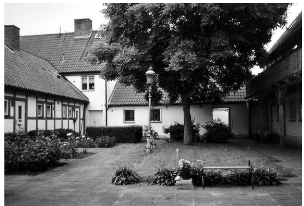
Fig. 8. Residential complex with the nest arrangement in Ystad, Sweden

A community house is an element which also appears in Dutch and Swedish group developments. It can be located within the complex as a detached building – in the development frontage and line or within the range of the internal courtyard, which closes the internal space of the