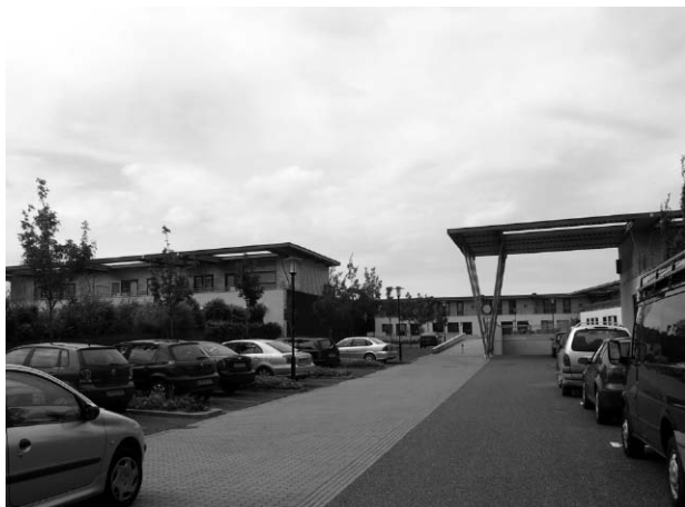
Fig. 9. Complex of Cohousing type in Middelburg, Holland (photo: E. Cisek)

Il. 9. Zespół typu cohousing w Middelburgu, Holandia (fot. E. Cisek)