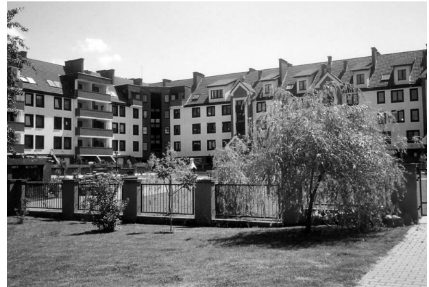
Fig. 11. Complex of multi-family development with the garden courtyard on Jaracza Street in Wrocław

Reducing the private space in favour of the common territory can also be noticed in arrangements with internal garden or walking courtyards and small, separate, private gardens within their limits. In these solutions on the external side there is only a public zone of the thoroughfare. Entrances (through ones) and small services are usually located on this side of the development. As an example we can mention the complex situated on Jaracza Street in Wrocław (architect Andrzej Miech, completed in 2000) (Fig. 11).