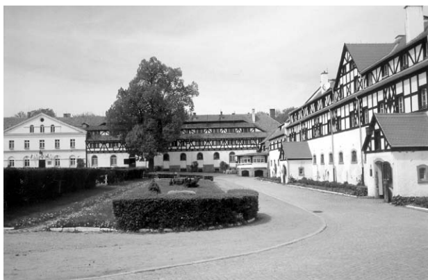
Fig. 10. Complex of old castle stables connected with the residential development in Książ

In residential complexes of Egebjergtoften and Egebjerggard III in Denmark a community house is a separate detached building situated in the close neighbourhood. In the first example, it is situated on the northern side of the residential development. It is partly located on water and constitutes a unique element in the arrangement of the whole complex. Inside the courtyards of three nests there are additional common facility rooms. A community house in Egebjerggard III was also designed as a separate building; however, it can be entered from the green interior of the complex. It constitutes a closure of the common courtyard space and at the same time it is an attracting element to which attention