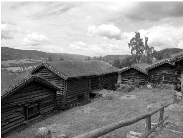
Fig. 3. Two-courtyard farm Bjørnstad in an open-air ethnographical museum Maihaugen in Lillehammer, Norway. The courtyard with farm extensions

II. 3. Gospodarstwo dwu – dziedzińcowe Bjørnstad w skansenie Maihaugen w Lillehammer, Norwegia. Dziedziniec z zabudowaniami gospodarczymi