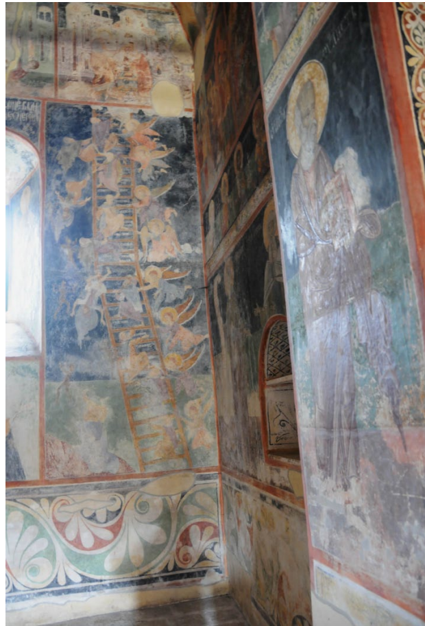
Fig. 3 Montenegro, Pivski Monastyr, fresco with the ladder of virtues on the north wall of the narthex 2009

Il. 3 Czarnogóra, Pivski Monastyr, fresk przedstawiający drabinę cnót na północnej ścianie narteksu 2009