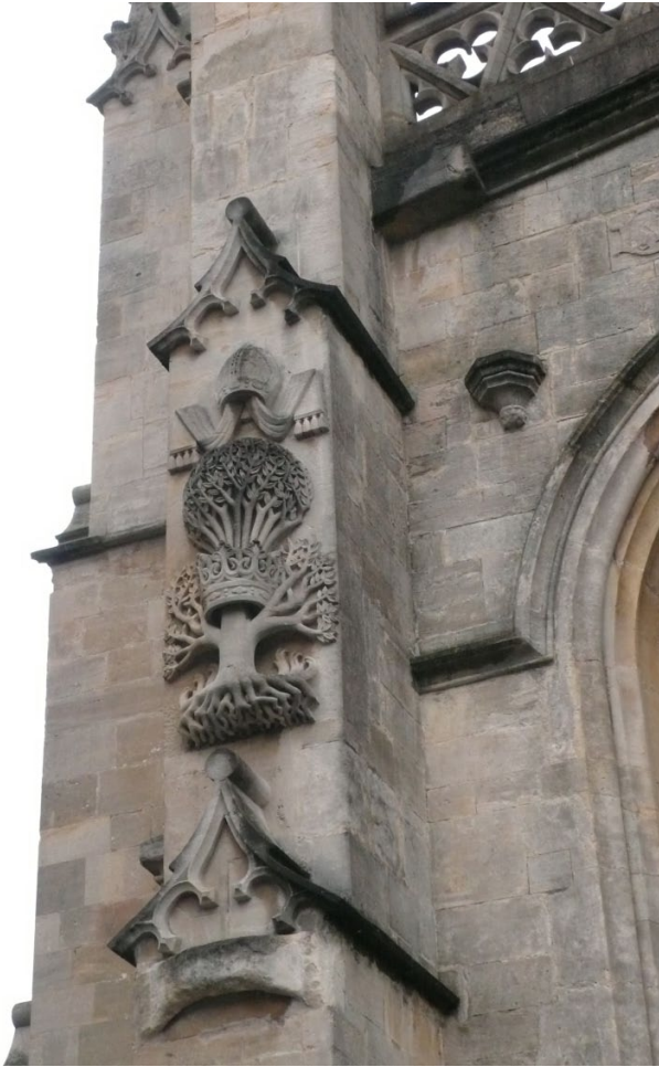
Fig. 6. Cathedral in Bath, west front, relief symbolizing Bishop Oliver King 2009

Il. 6. Katedra w Bath, elewacja zachodnia, relief symbolizujący bp. Oliviera Kinga 2009