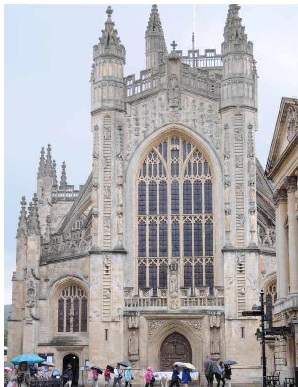
Fig. 1 Cathedral in Bath, west front 2009