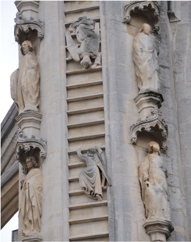
Fig. 2 Cathedral in Bath, west front, fragment of the ladder of virtues on the north side 2009

Il. 2. Katedra w Bath, elewacja zachodnia, fragment drabiny cnót po stronie północnej 2009