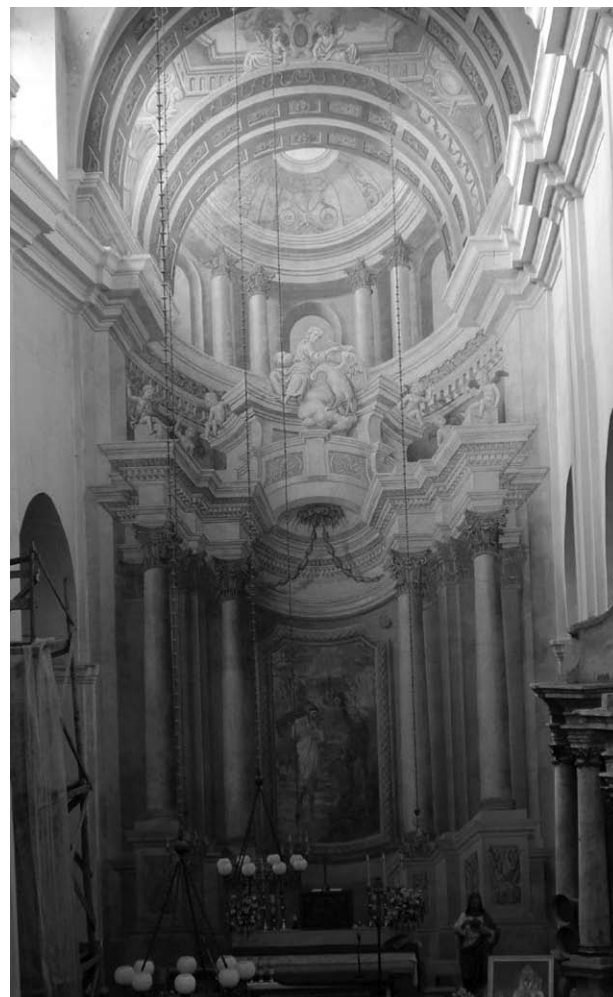
Fig. 10. Holszany, painting after conservation

The painting in the church in Holszany, despite being surely the nicest, is just a small part of the conservation works. The preliminary plan of restoration of the original polychrome on the marble altars was developed; conservation of a part of one of them was the subject of a master’s thesis 16 . It