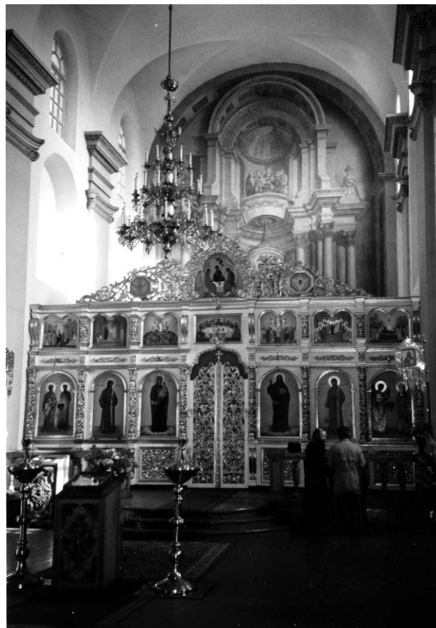
Fig. 5. Interior of the monastic orthodox church of the Basilians (currently eastern orthodox), Liady. Behind the iconostasis on the sanctuary wall, the upper section of painted altar.

Il. 5. Wnętrze cerkwi klasztornej bazylianów (teraz prawosławnych), Liady. Za ikonostasem na ścianie prezbiterium widoczna górna część namalowanego ołtarza.