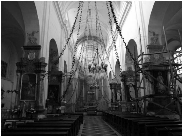
Fig. 2. Holszany interior of the church with side altars

Il. 2. Holszany widok wnętrza kościoła z perspektywą ołtarzy bocznych