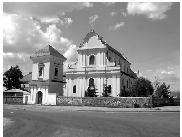
Fig. 1. Church in Holszany

In the 1930s, the Soviet authorities closed the church in Holszany and turned it, just like many other churches, into workshops. It was given back to the believers only in 1990, and at the very end of the 20 th century, the Franciscan monks returned there too. However, they found the temple, which once was famous for its excellent pieces of sacred art, destroyed and devastated. There were no altar paintings, wooden pews, confessionals, Rococo ornaments, carved in wood figures of four Evangelists and St. John the Baptist that once decorated the pulpit, or the pulpit itself, which was earlier located by the side altar of St. Anthony. The wooden elements of its interior decoration were probably burned down by the workshop workers. The Belarusian muse-