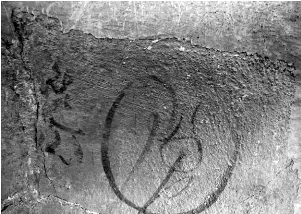
Fig. 7. Holszany, original signs with a pink cloud in the background pose an interesting riddle for researchers. It is possible that it is a form of signature and date (?)

Il. 7. Holszany, znaki zachowane na tle różowej chmury stanowią interesującą zagadkę dla badaczy. Możliwe, że jest to forma sygnatury i data (?)