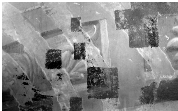
Fig. 6. Holszany; uncovered patches of the original painting in its uppermost section

Stage one included technical works 12 . At the moment when the team of conservators came, the scaffold was already in place. Its traditional structure built with the use of wooden beams and boards was so dense that it was practically impossible to see the composition from the level of the floor or the choir. It turned out to be a serious difficulty in visual inspection of the condition of the whole painting. However, the scaffold enabled the conservators to examine all details of the monumental decoration. Before the works began, due to the results of microbiological tests, Lichenicide in alcoholic solution was sprayed in the air. The process was repeated twice in order to reduce the hazard caused by the presence of microorganisms. The agent was also sprayed in the areas close to the altar wall and in places where the traces of mold were evident. The condition of substrate seemed surprisingly good and only after