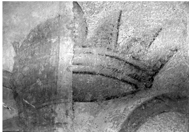
Fig. 8. Holszany, originally a crown was painted under the cartouche and then a pope's tiara and keys of St. Peter appeared in two successive layers

Il. 7. Holszany, znaki zachowane na tle różowej chmury stanowią interesującą zagadkę dla badaczy. Możliwe, że jest to forma sygnatury i data (?)