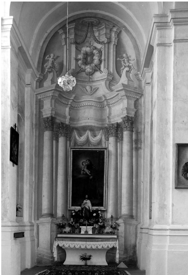
Fig. 3. Side altar of St. Anthony in the church of Friars Minor in Budslaw

um employees saved the marble tomb monument of the founder of the Franciscan estates in Holszany – Paweł Stefan Sapieha and his two wives (Regina and Elżbieta) from total destruction. It was moved to the Museum of Early Belarusian Culture in Minsk. What remained of