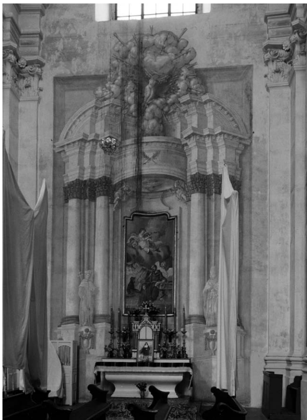
Fig. 4. Side altar of St. Francis in the church of Friars Minor in Budslaw (photo: G. Trimakas, 1997)

Il. 4. Boczny ołtarz św. Franciszka w kościele bernardyńskim w Budslawiu (fot. G. Trimakas, 1997)